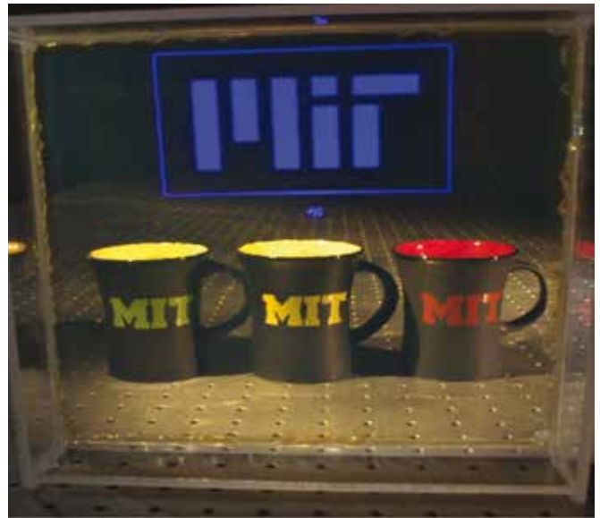
Using nanoparticles, an image of a blue MIT logo is superimposed on a glass screen. The cups are physical objects behind the screen.

Metal oxide nanoparticles, which have also been explored as potential obscurants, have alternative military uses, including their ability to react with and destroy chemical and biological warfare agents. Nanocrystalline metal oxides are