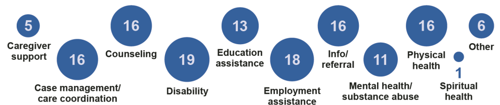
Transition to Civilian Life: Number of DOD and VA Programs by Type of Service

Source: GAO analysis of Department of Defense (DOD) and Department of Veterans Affairs (VA) programs. | GAO-15-24