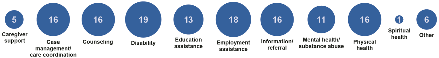
Figure 2: Transitioning and Readjusting to Civilian Life: Number of DOD and VA Programs by Type of Services Provided

A detailed, interactive list of programs is available at http://www.gao.gov/products/GAO-15-24