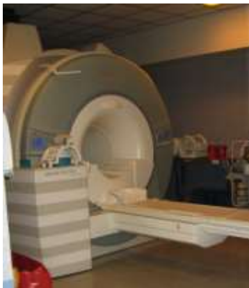
Figure 2. MRI scanner used for this study

To date, six control participants, seven fibromyalgia patients, three migraine with aura, and two mild TBI patients with chronic pain completed the study in its entirety. One control patient scan was incomplete due to an expected power failure during scanning, and another control patient withdrew from the study after consenting. One control subject was not able to be scheduled for imaging due to work conflicts.