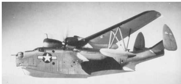
Fig. 1 – Martin Mariner PBM-3, circa 1944

Where is the state of the art in Air ASW Technology? To answer this question with perspective, I reviewed a U.S. Navy training video on Airborne ASW, a "how to" for operational personnel. What was described is what one would expect, i.e., an aircraft deploys a radio sonobuoy, the sonobuoy deploys a hydrophone sensor, and finally, acoustic data is transmitted from the buoy to an aircraft where it is analyzed for submarine signatures. The video offered a pretty basic description involving basic concepts and technology. The unusual aspect here was the date of the video, 1944. The aircraft involved was a Martin Mariner PBM-3 (Fig. 1), the sonobuoy, an AN/CRT-1, the Navy's first operational sonobuoy. The submarine was, of course, a WWII vintage diesel-electric.