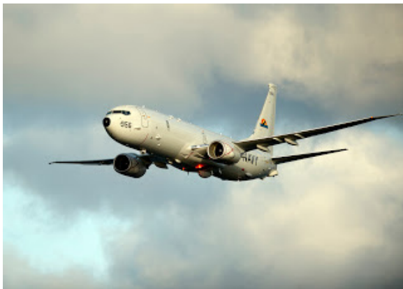
Fig. 3 – Boeing P-8 Poseidon