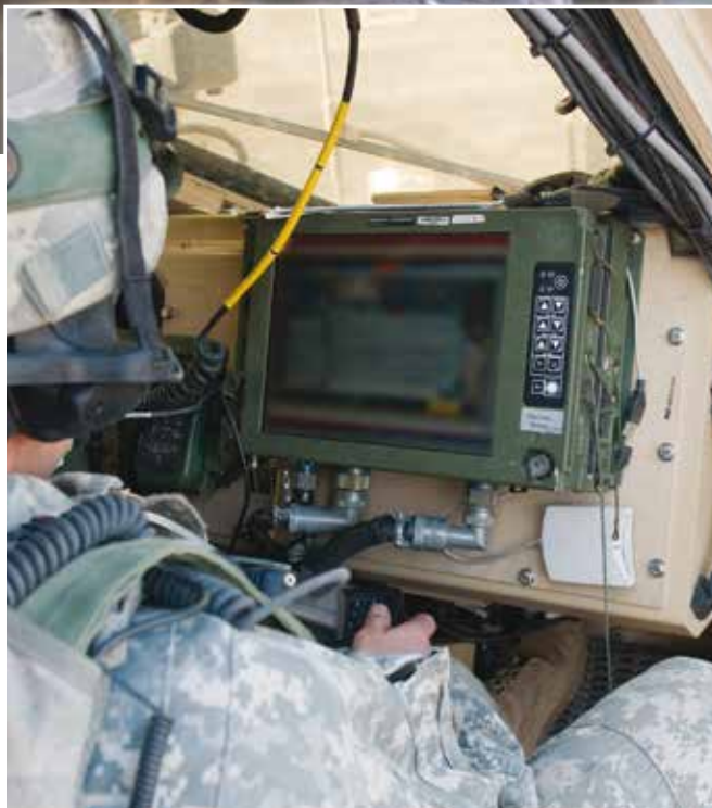
Top: The capability Soldiers relied on for situational awareness, Force XXI Battle Command Brigade and Below/Blue Force Tracking (FBCB2/BFT), is being upgraded in two phases.