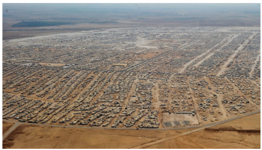
An aerial view shows the Zaatari refugee camp on July 18, 2013, near the Jordanian city of Mafraq, some eight kilometers from the Jordanian-Syrian border.

will be taken against the Jordanian government and society at large. As of June 2014, support was growing for The Islamic State declared by ISIS in Iraq and Syria.<sup>4</sup> The chaos inside Syria and the criminal elements involved in the illicit trade along the border form a toxic mix that can only contribute further to the instability. Halting this cross-border flow as part of a larger international effort to create safe zones within Syria would be one way to impede the spillover. The contagions of refugee flow and external military assistance would also be contained as trafficking would be curtailed and refugees could be moved back into protected areas on the Syrian side of the border. Jordan could reap benefits by playing a key role in the humanitarian effort.