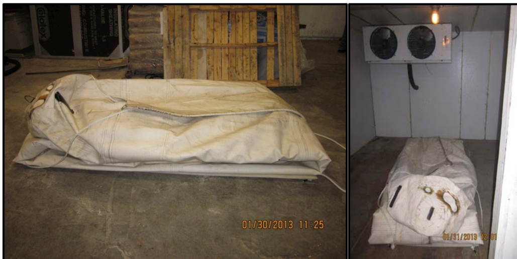
Figure 7. LMCS pontoon tri-folded in 2 directions (left) and ready for cold cycling at -40^{\circ}\text{C} in CRREL's basement cold room (right).

The test plan called for the 25 ft long × 5 ft diameter pontoon to be tri-folded longitudinally and then tri-folded transversely and stored in a cold room for 24 hr at -40^{\circ}\text{C} (Figure 7) prior to unfolding and immediate inflation outdoors. We conducted ten folding–cold storage–unfolding–inflation test cycles during the New Hampshire winter (between 25 January and 13 March 2013) to best represent the summer daytime temperatures at McMurdo Station. Our previous material-testing experiences helped determine the recommended timeframes for cold soaking the pontoon and subsequently inflating the pontoon and letting it rest outdoors to equilibrate and to provide sufficient pressure data to determine whether leaks were present. We selected a minimum cold soaking period of 24 hr and a minimum inflation period of at least 2 diurnal cycles.