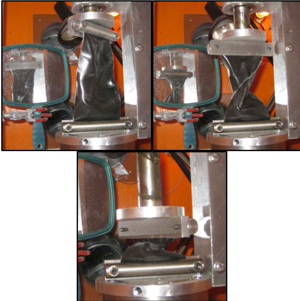
Figure 1. Photo sequence of LMCS pontoon material undergoing Gelbo flex tests at -40^{\circ}\text{C} . The apparatus imposed a 440^{\circ} rotation during the first 3.5 in. compression, followed by straight compression for 2.0 in. Each cycle took 2 s to compress the specimen and 2 s to reverse the motion (4 s total cycle time). A mirror allowed visual inspection of the back of the specimen without removing it from the apparatus.

ASTM F392 does not specify how to assess the effects of flexing on the specimens. We chose to use visual inspection followed by an air-permeability test to assess relative flex durability. After conditioning, we visually inspected each specimen for signs of cracking or delamination of the coating from the embedded woven fabric. We marked such regions on the specimen and then conducted a check for air leakage at room temperature. The leakage-test apparatus consisted of two aluminum disks with embedded O-rings, with the upper disk connected to an air reservoir. After pressurizing with air, we sealed off the air reservoir and monitored disk pressure over several minutes to assess the leakage rate (Figure 2). The difference in leakage rates between intact and cracked specimens was readily apparent.