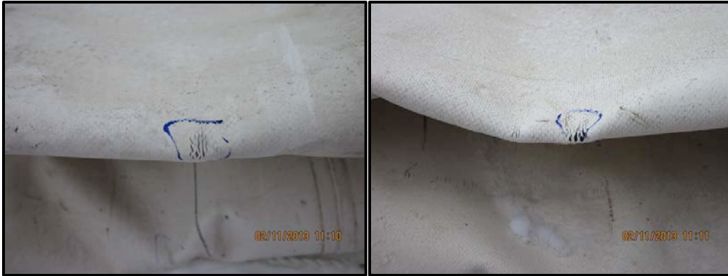
Figure 10. Cracks in the white painted-on coating formed at the “double-fold” points. We identified these cracks while unfolding the pontoon prior to inflation after Cold Cycle #3. Note that cracks in the coating did not affect pontoon performance.

A final observation in the analysis of the air mass loss data determined that the pontoon had higher mass loss rates in 7 of the 8 valid tests than it did during the two baseline tests. We suspect that temperature changes caused by diurnal cycling and direct exposure to the sun contributed to air loss in two ways: (1) by causing increased internal pressures and (2) by affecting the elasticity of the pontoon fabric. These changes would make it easier for air to escape at the small leak locations while it was outdoors than when it was at a relatively consistent basement temperature during the baseline tests.