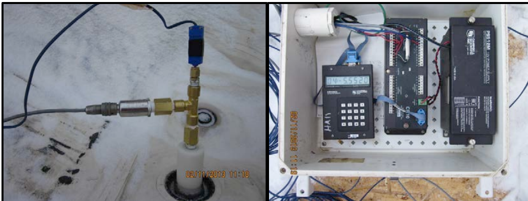
Figure 8. Pressure transducer and thermocouple instruments fitted to the pontoon's pressure relief valve (left) and data monitoring system that measured and recorded the internal pontoon temperature, the external (ambient) air temperature, and the pontoon (gauge) pressure (right).

We conducted a baseline air mass loss test just outside of the cold room in the basement of CRREL prior to initiating the cold cycling test sequence. We later compared the baseline air mass loss rate with an identical post-test baseline loss rate to determine whether or not the cold cycles and folding and unfolding caused additional damage to the pontoon. We also measured and recorded air temperatures and pressures during the exterior inflations between cold cycles and calculated air mass loss rates during each of those tests (Figure 9).