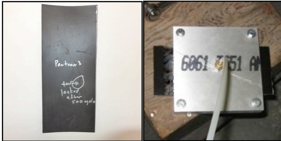
Figure 2. After conditioning material specimens in the Gelbo flex apparatus for a number of cycles, we removed and inspected them for cracks (left) and then clamped over the cracked areas with a leakage-test apparatus to assess failure (right).

We also conducted standard Gelbo tests on the gum-sheet fabric samples and conducted modified Gelbo tests on the vulcanized samples. It was necessary to modify the Gelbo procedure for testing heavier, vulcanized (or very thick) fabrics because the Gelbo test apparatus can be damaged by the rotational forces required to rapidly bend these extremely stiff, frozen specimens. For our test of the vulcanized samples, we reduced the total rotation to 250^\circ and the compression to 2 in. (Figure 3). We ran the first 10 cycles for each of these samples 5 s/cycle to reduce the possibility of damaging the test equipment, and we ran the subsequent 1190 cycles at 1.5 s/cycle.