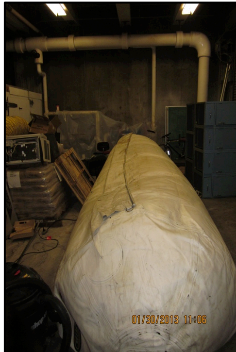
Figure 5. The LMCS pontoon as delivered to CRREL and partially inflated prior to leak identification and patching.

CHL and GSL made a full-scale pontoon available to CRREL for testing. The objective of these tests was to determine whether the folding, cold storage, unfolding, and inflation sequence would have the potential to cause cracking or leaks in the fabric or fabric joint welds. Upon receiving the pontoon, we inflated it and determined that there were 5 leaks caused from prior use as the pontoon was taken from a prototype LMCS that had undergone extensive field testing (Figure 5). Once we identified 4 of the 5 locations using a soap-bubble product and, based on leak rates (rate of bubble production), the relative sizes of the damage, we determined that only the fifth site (identified visually and audibly) was large enough to require patching (Figure 6).