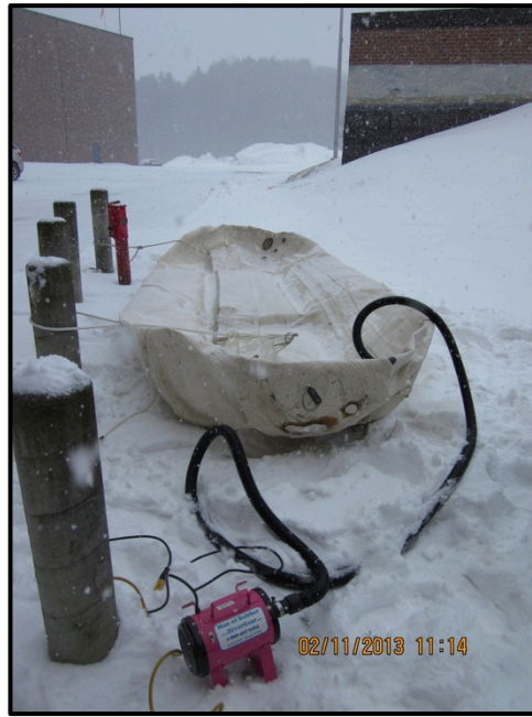
Figure 9. Inflating the LMCS pontoon outdoors during post cold-cycle test 3. Note that instruments are not yet installed in the pressure relief valve at the far end of the pontoon as per Figure 8 above.

Based on the manufacturer's specifications, we established the target pontoon inflation pressure to be 1.8–2.0 psi (the maximum design pressure for the pontoons is 3.0 psi). After allowing the large patched area to cure, we inflated the pontoon to approximately 1.9 psi and determined the background air mass loss rate for the pontoon at the ambient basement air temperature (about 13°C). We applied a linear regression analysis to the air mass loss calculations to determine the air mass loss rate. The average air mass loss rate for 25–30 January 2013 was -0.020 lb/hr. Table 2 contains the air mass loss rate and notes from each test and Appendix A illustrates comparisons of the two baseline and post cold-cycle inflation tests.