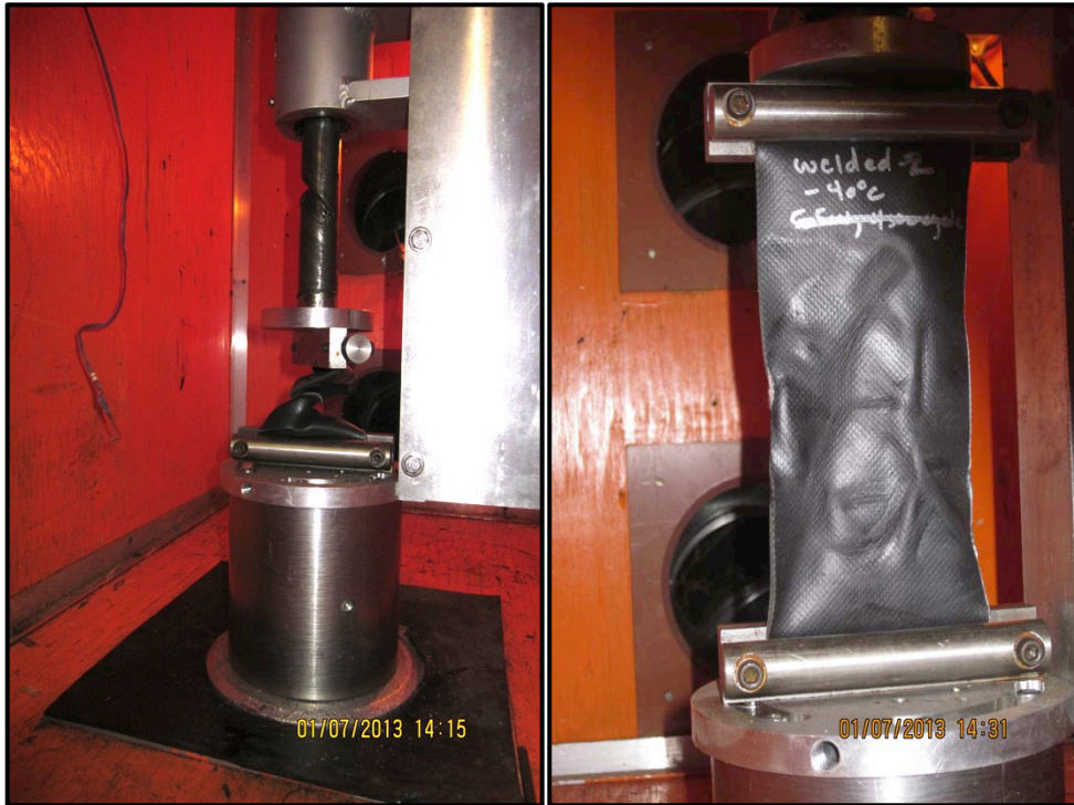
Table 1. Gelbo flex test results for the LMCS pontoon fabric, gum (abrasion) sheet, and composite fabric (the gum sheet vulcanized to the pontoon fabric).