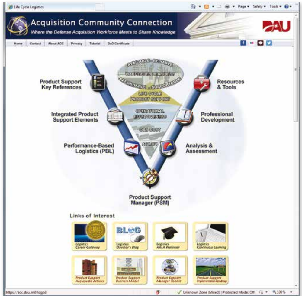
Figure 1. Life Cycle Logistics Community of Practice (LOG CoP)