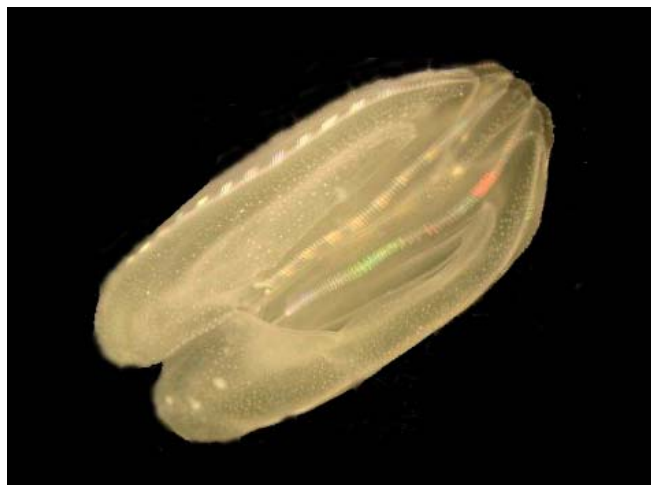
Figure 1: The ctenophore, Mnemiopsis leidyi

Mnemiopsis leidyi , a native-American comb jelly (Figure 1), was first introduced into the Black Sea in 1982, where it caused the total collapse of the local fisheries. It has recently broken out into the Mediterranean Sea. Also, there is evidence that blooms within its native range along the east coast of the United States are increasing and producing profound impacts on coastal ecosystems. Given its ubiquity and its exceptional hardiness there is concern that it may continue to spread.