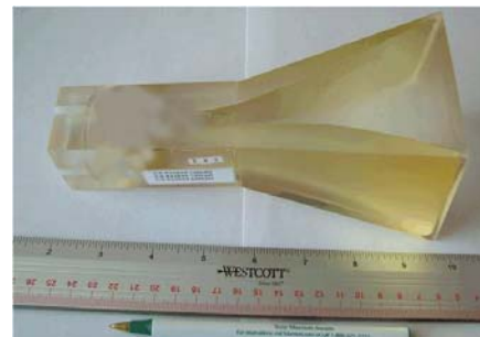
Figure 2. Loki FEG with exponential horn (courtesy of J. Baird).