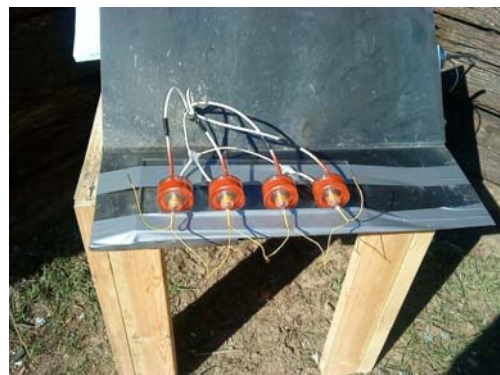
Figure 4. Multi-FEG array built by Radiance (Courtesy of Zachary Roberts, Radiance).

Ferroelectric generators have been found to be effective compact power sources that produce high voltage pulses driven by an explosive event. However, a difficult problem associated with using ferroelectric generators to power RF devices is that passive device systems such as antennas using basic LC oscillatory waves and spark gaps limit the RF generated by such devices to radiating in the low 100’s of MHz band of the spectrum.