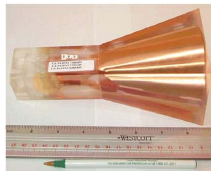
Figure 1. Loki FEG with circular horn.

It turns out that FEGs are excellent power supplies for driving antennas or other high impedance devices. Three examples will be considered here: 1) FEG driven dipole antenna [7] FEG driven sinuous antenna [8], and 3) Loki FEG driven horn antennas.