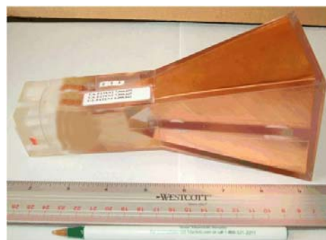
Figure 3. Loki FEG with rectangular horn (courtesy of J. Baird).