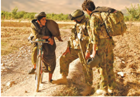
A Major and local Afghan Interpreter speak with local Afghan man whilst travelling through the Baluchi Valley, Southern Afghanistan.