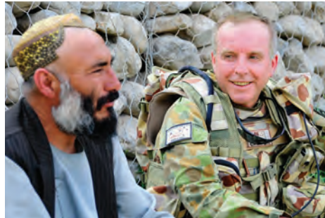
An Australian MAJGEN takes time to meet with local community members during the day and share a word and a cup of chai.