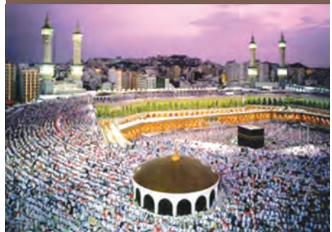
Crowd of Faithful at the Hajj Pilgrimage.