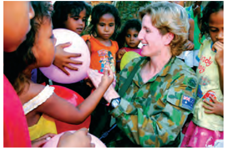
ADF Soldier with local children.

212 Children are an important part of any society, but there are different ideas and laws about how they should be raised, what work they should do, and how they may be disciplined. Children everywhere love fun and games. In appropriate situations, an impromptu game of soccer can be a good way to break the ice and build rapport.