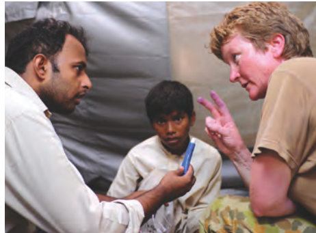
An Australian Army Nurse talks to a Pakistani interpreter to relay the dosage of medicine required for her young Pakistani patient.