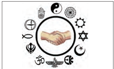
Symbols of Major World Religions.

213 Religion, beliefs and faith are a significant aspect of the lives of almost every individual, even if they claim not to be "religious". These factors shape the way we live our lives, including the roles of men, women and children, the way society is structured, the way we interact with each other, and the laws that society creates. While on deployment, you should be aware of local beliefs and customs, and should respect them (even if they seem strange to you).