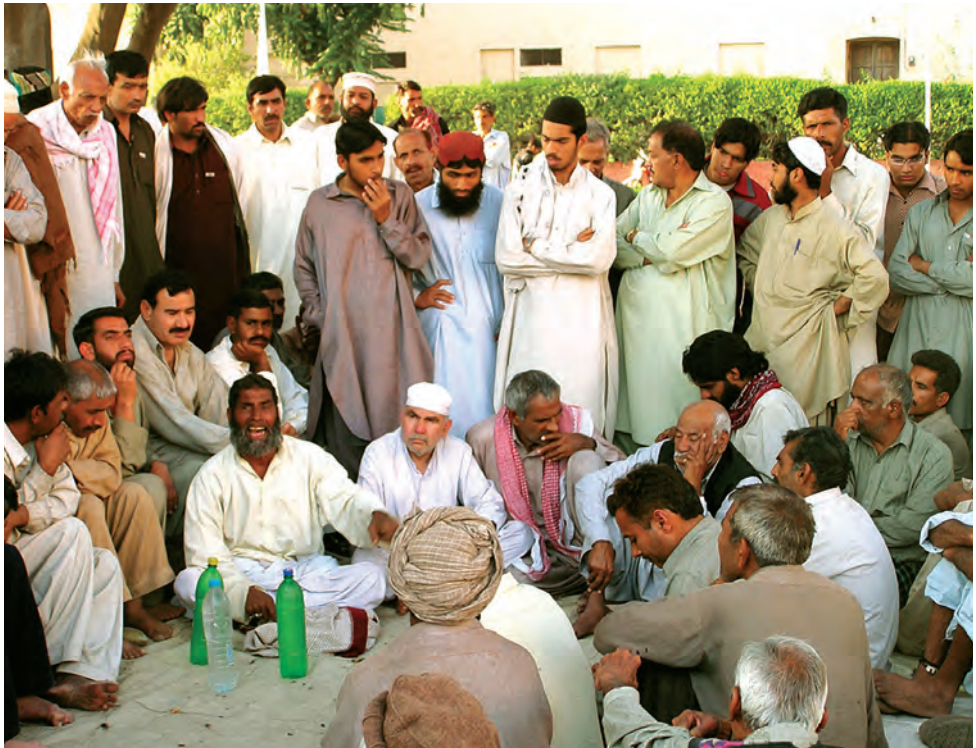
Storytelling in Lahore, Pakistan.

Experience has demonstrated that questions such as these not only encourage participants to share about the things that most affect them (and by implication possible sources of future instability or positive change) but also highlight local capacities for positive change in the community.