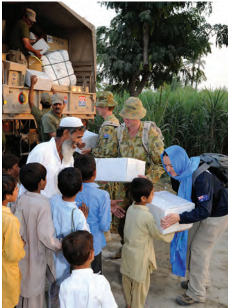
Distributing emergency aid in Pakistan.

414 IGOs are likely to be willing to engage with the ADF. This includes the major UN agencies and several non-UN organisations such as the World Bank and IMF. NGOs, however, may be more hesitant as it is important for them to be seen to maintain their impartiality.