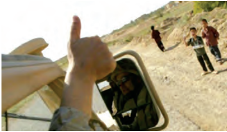
Giving the thumbs up. In much of the Middle East, Afghanistan, Iran and some of South America, this sign is extremely offensive.