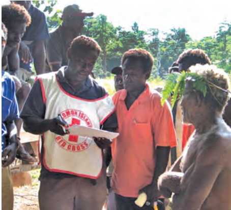
Red Cross in Solomon Islands.

is reduced and their staff endangered. In the field this may lead to a reluctance to engage openly with the ADF or to accept ADF logistics, transport or security support. It may also lead to conflict over the ADFs involvement in the provision of humanitarian assistance.