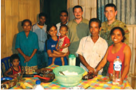
DSTO Analyst and member of International Stabilisation Force share a meal with a local family in Timor Leste.

for the visit. These formalities are significant on two levels: First, it is considered polite and courteous, and secondly it is an important trust building exercise. These conversations should not be rushed.