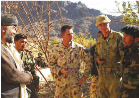
Locals talking to ADF.

Locals may be observers, recipients of assistance, people you employ, subject matter experts, participants in the conflict or colleagues. To win their support, you should try and ensure their participation in the ADF mission is a positive experience.