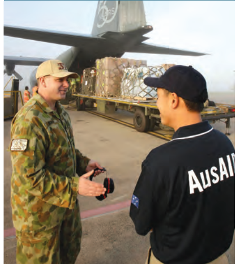
AusAid supplies are loaded onto a Hercules C-130H at RAAF Base Richmond bound for Fiji.

causes of conflict. Even where access for international civilian staff is limited, AusAID may, through their local implementing partners, have a perspective that reaches beyond the capital city and to elements of society other than the ruling elites.