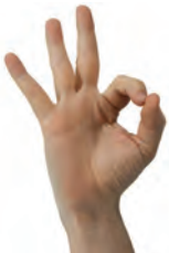
This sign has many meanings. In Australia it could mean 'zero' or 'ok'. 'Ok' is the most common interpretation internationally. However in Brazil and other South American countries, Germany, Turkey, Iran and Russia it can be an offensive suggestion that you are a homosexual, while in Japan it means "money."