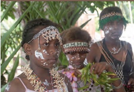
Passing on traditions through the generations.

In this social situation it may be difficult to determine what constitutes corruption and what constitutes the normal functioning of a society that is different from our own. Often the answer is simply a matter of scale and impact. When the resources of the state are captured by a single group and the Wantok system is used as an excuse for that group’s enrichment at the expense of others, it is likely to be a significant driver of conflict.