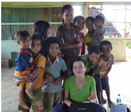
DSTO Analyst with local children in Timor Leste.