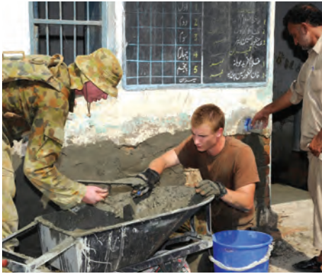
ADF working with locals to rebuild a Pakistani school.