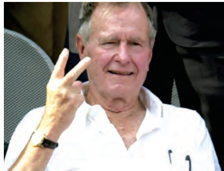
George Bush Snr visiting Australia. He believed he was giving the "peace" sign as a friendly greeting to us Aussies, but clearly made a mistake.

305 While overseas, try to find out about local gestures. Watch how the locals behave. Ask a local if you aren't sure what is being said, or if you don't receive the expected reaction when trying to communicate.