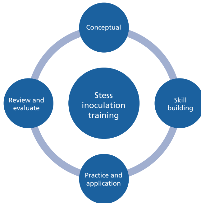
Figure 2.1 Phases of Stress Inoculation Training and Evaluation