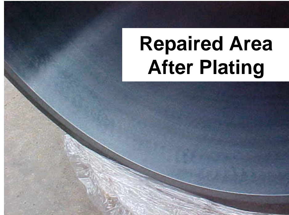
Repaired Area After Plating