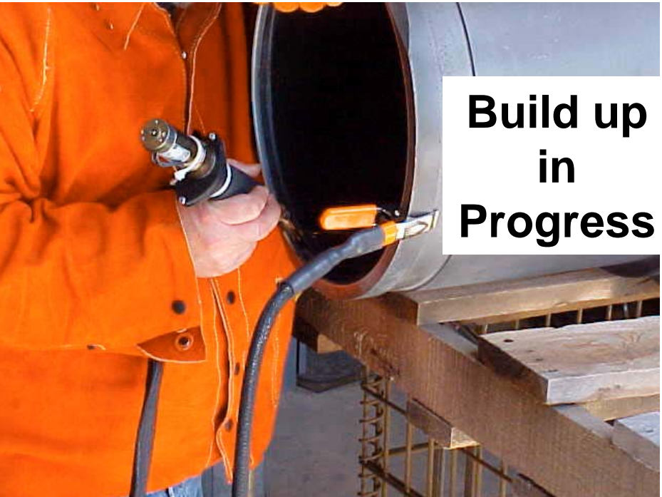
Build up in Progress