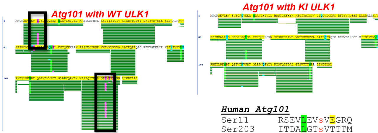
Figure 2. In vivo phosphorylation sites were defined in the ULK1-binding partner ATG101 when it was co-expressed with wild-type (WT) or kinase inactive (KI) ULK1 in HEK293T cells. We identified two specific serines in ATG101 which match the optimal ULK1 substrate consensus (LxxpSVxx).

Task 3 and 4 lie outside of what was anticipated for the initial year of funding, though the effects of ULK1 inhibitors on cell growth, as in Task 3, are also further explored in Task 5, which is a final Task that we have also made significant advances in. In Task 5, we propose to spend the first year of funding defining how well novel catalytic inhibitors of ULK1 we test and help validate can act as cytostatic or cytotoxic agents for treatment with nutrient starvation or treatment with mTOR catalytic inhibitors. We now have a tool compound, Compound 6, that serves this exact purpose and shows excellent catalytic inhibition towards ULK1 (see Figure 3). As currently there has not been a single reported ULK1 inhibitor in the literature, and ULK1 is the only druggable kinase in the classic autophagy pathway, we believe these results will be of great interest to many, and we are preparing to submit a paper in the next 2 months including all of the findings reported in this annual report.