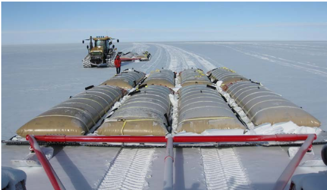
Figure 5. Bladder sleds towed during SPoT09–10.

The components of bladder sleds are relatively inexpensive: $10,000 per fuel bladder; $5000 per HMW-PE sheet; and $5000 for towplates, strap-