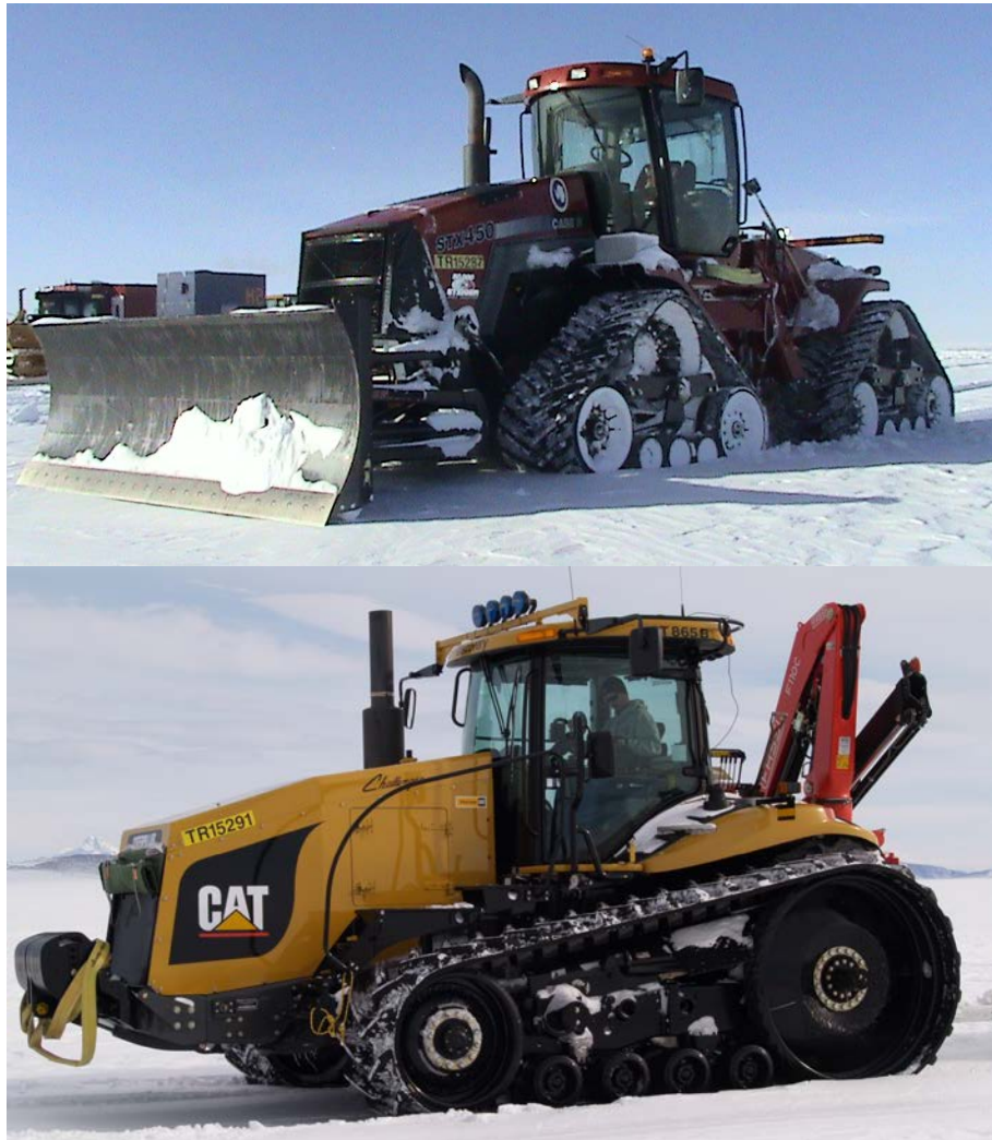
Figure 3. Examples of SPoT tractors: Case Quadtrac (upper) and AGCO MT865 (lower).

The capital cost for both tractor types is approximately $500,000, including spare-parts kits and vessel delivery to McMurdo. Although two Quadtracs carried over from the proof-of-concept phase, we include their