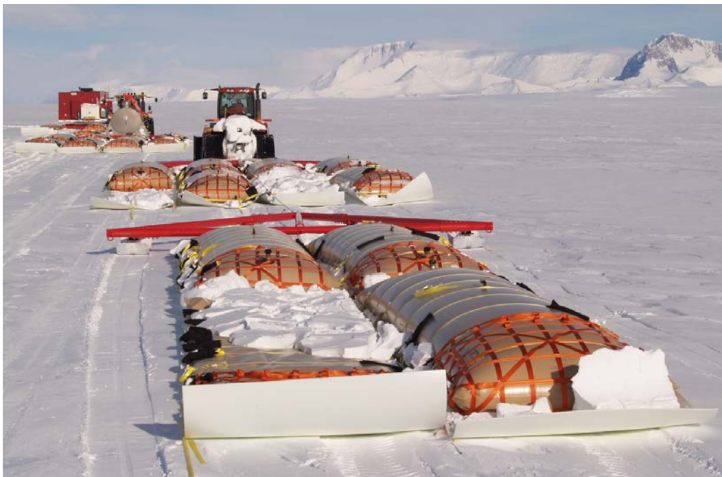
Figure 2. Three SPoT sled trains heading up the Leverett Glacier en route to South Pole during the 2008–09 season. The front-most train includes the living and generator modules (red). Next in line is an MT865 towing a steel fuel sled (grey) and eight 3000 gal. bladders on flexible sleds (tan). The red Quadtrac is towing two coupled sets of bladder sleds, initially consisting of twelve 3000 gal. bladders but subsequently reduced by fleet consumption. The bladder sleds include steel towplates to attach them to spreader bars (red). Note that SPoT08–09 repositioned two steel tanks used as remote fuel caches but did not tow fuel in tanks for delivery to South Pole.

Table 1 provides a summary of SPoT's first three seasons of operational deliveries. We determine the LC130 flights offset based on an average delivered payload of 25,600 lb per flight to South Pole (RPSC 2011). SPoT