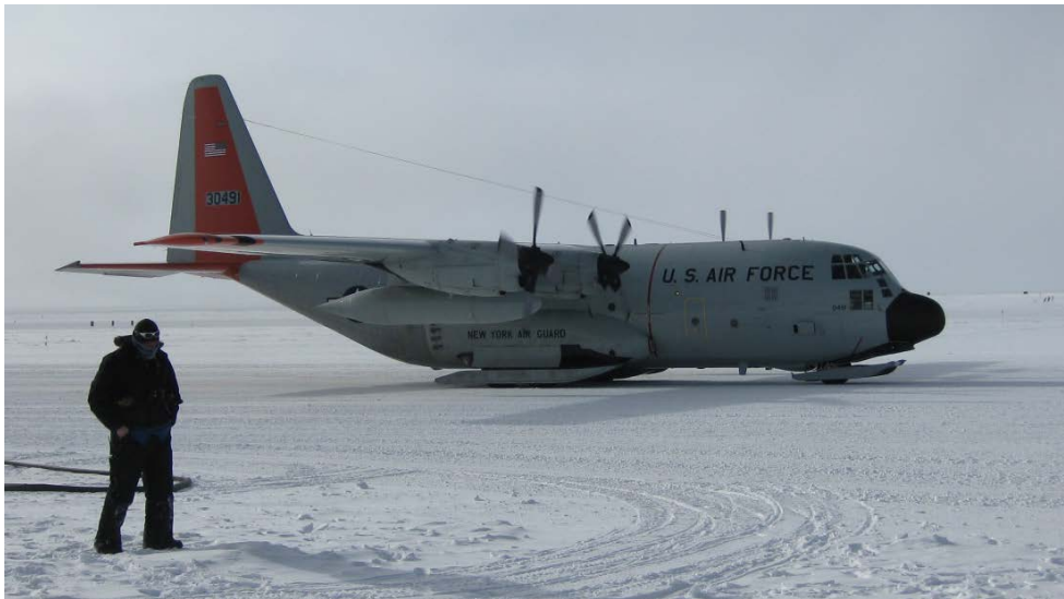
Figure 6. LC130 at South Pole about to off-load passengers and cargo.

In general, LC130 costs are established for the entire USAP airlift effort and are not broken down by destination. However, many components of LC130 costs scale with flying hours (e.g., crew labor, fuel consumption, maintenance). Therefore, we will apportion costs to the South Pole airlift based on its fraction of the total LC130 flying hours conducted for USAP.