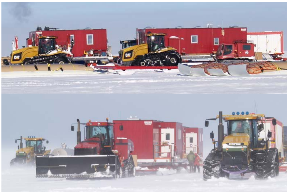
Figure 4. Two photos showing SPoT fleet-support sleds. The red living and generator modules are usually towed as a coupled pair. The white module with red borders contains frozen and dry food. A similar sled carries fleet spare parts in a standard shipping container. The small red vehicle in the upper photo is the Pisten Bully 100 used in 2008–09 to conduct radar surveys for crevasse detection in advance of the fleet.

Figure 4 shows SPoT's steel fleet-support sleds en route to South Pole in 2008. The living module contained berthing for the crew, a galley, and a communications center. The generator module contained two diesel-electric generators, shower, laundry, snow melting facilities, and an incinerating toilet. A refrigeration module was built into a 20 ft long shipping container, which carried frozen and dry food. A similar sled (called the tool shed) carried fleet spare parts.