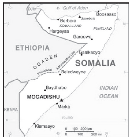
Figure 1. Map of Somalia. U.S. State Department map.

Somalis still make irredentist claims on the three areas outside of Somalia’s borders, 30 as most prominently symbolized by the five points of the star on the Somali flag—each point