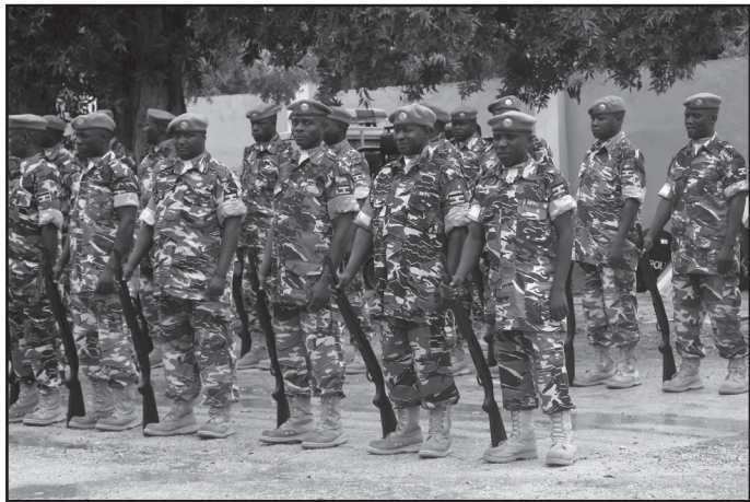
Figure 6. Police Units of the African Union Mission in Somalia (AMISOM) stand in position after concluding training in the Somali capital Mogadishu.

community as well. The East African newspaper ran a story that mentioned the rivalry among AMISOM troops from different countries, and contended that an arms race was ongoing between Uganda and Ethiopia. 560