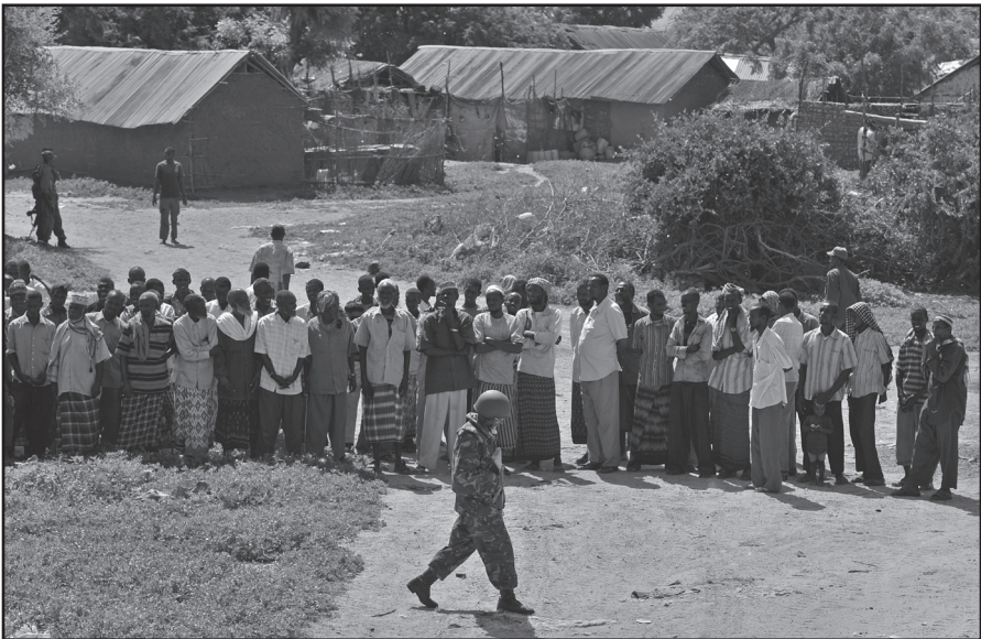
Figure 4. Kenyan Defence soldier and villagers in Burgabo, Southern Somalia.

Think of Sheikh Sharif Sheikh Ahmed who was a prominent member of the ICU before it collapsed after an attack by the U.S.-supported Ethiopians. 129 Ahmed then partnered with Sheikh Hassan Dahir Aweys to form the Alliance for the Re-liberation of Somalia, though the two eventually had a falling out. 130 Aweys’ name can now be found on page three of a U.S. Treasury Department report listing Specially Designated Terrorists, 131 while