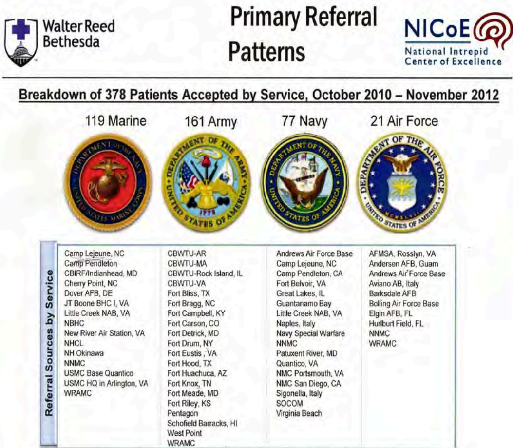
Figure 1 31

“tip of the iceberg”; there are likely thousands of Marines and sailors silently suffering from these wounds- they are waiting for their command team to set the command climate that fosters accountability and encourages wounded warrior care in a thoughtful manner.