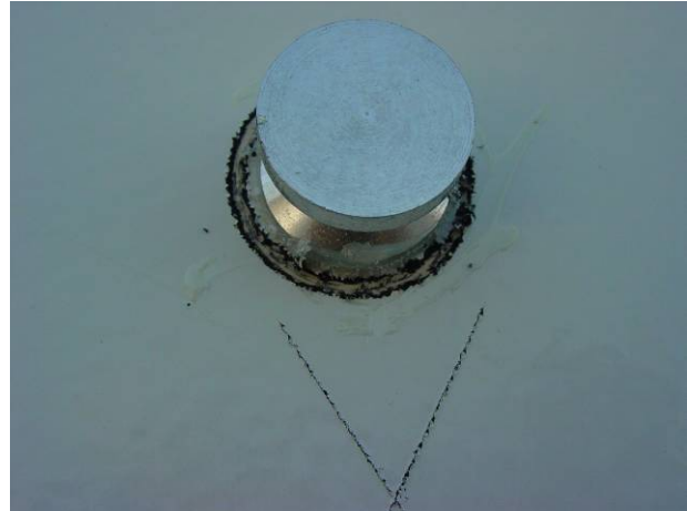
Figure 12. Adhesion testing of the coating after 1 year.