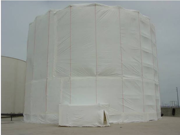
Figure 7. Containment plastic over scaffolding on tank 2003.

Surfaces were prepared for overcoating by abrasive scrubbing followed by low pressure water cleaning at 3000 to 4000 psi (Figures 7 and 8). This resulted in about 3% to 4% topcoat removal on the roofs but less than 1% on the walls. Water and debris were collected and removed in accordance with contract requirements. A total of about 70 gallons of LVBC/ZVT coating on Tank 2003 sides and roof was applied by an “airless” pressurized system with best results at about 2800 psi (Figure 9). About 25 gallons were applied by squeegees and rollers to the roof of Tank 2001 (Figure 10). The spray system provided better results. Some rework was required, but overall job quality was acceptable. The need for carefully managed automatic mixing of components and water thinning of the ZVT was the primary need for the on-the-job learning of the paint contractors. This was primarily the need for carefully managed automatic mixing of components and water thinning of the ZVT.