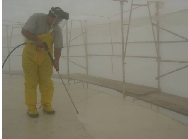
Figure 8. Surface preparation by water blasting.