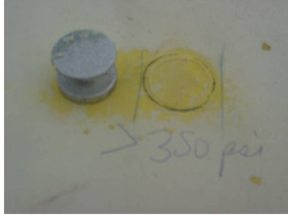
Figure 6. Adhesion pull test on original coating.