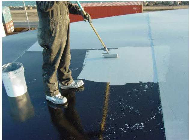
Figure 10. ZVT applied by rollers on tank 2001 roof.