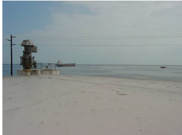
Figure 4. View from the top of Tank 2001.

DESC San Pedro exterior AST coating operations generally involve initial coating application using guidance similar to UFGS 09 97 13.27 "Exterior Coating of Steel Structures" followed by either allowing the coating system to fail and then completely removing and reapplying in accordance with UFGS 09 97 13.27 or by performing short-term unsuccessful spot maintenance painting. When complete removal and reapplication in accordance with UFGS 09 97 13.27 is compared to maintenance painting employing the LVBC/ZVT, the major cost differences appear to be as follows: