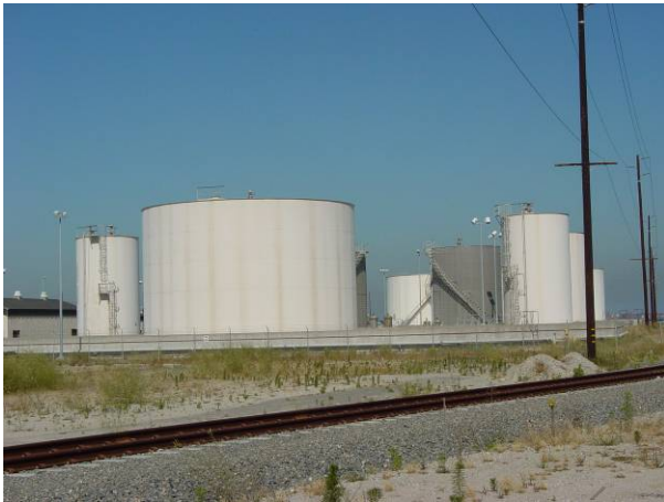
Figure 3. DESC demonstration site, Long Beach, CA.

The representative DoD site selected is located in Southern California at the DESC, San Pedro. The site is located at the entrance to the Port of Long Beach and is less than 2000 feet from the ocean. The LVBC/ZVT maintenance painting demonstration was performed on the exterior of two 10,500 SF ASTs (846K gallons each) originally coated in 1987 (Figures 3 and 4). DESC personnel, PolySpec L.P., and the DoD technical points of contact (POC) were involved in performing and assisting with the demonstration at the DESC site.