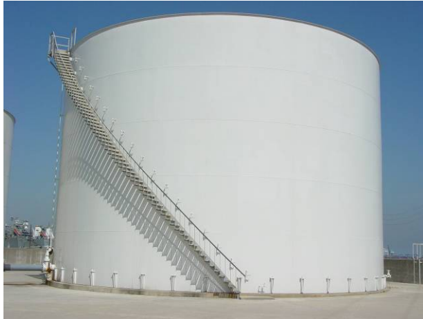
Figure 11. Tank 2003 1 year after application of LVBC/ZVT system.