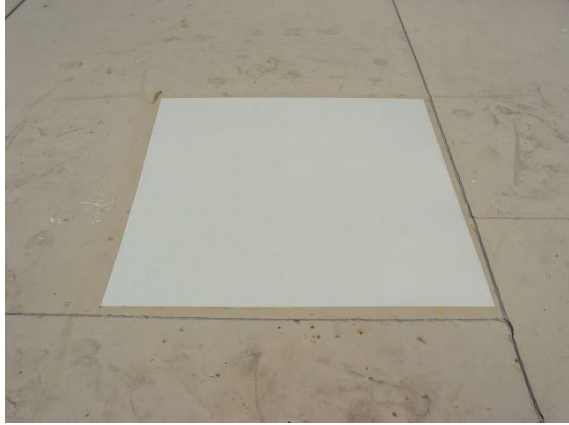
Figure 5. LVBC/ZVT test patch.