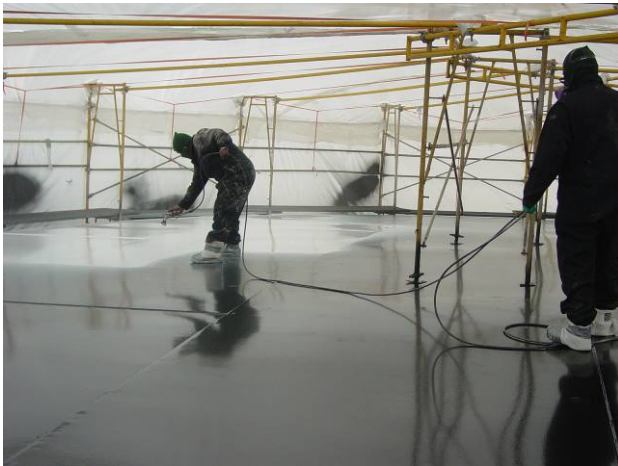
Figure 9. Spray application of LVBC barrier coating on tank 2003 roof.