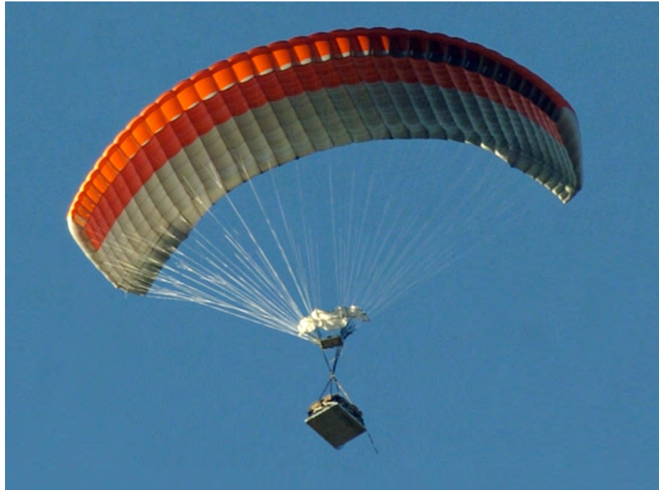
Figure 2. Dragonfly system in flight

rely heavily on the effective integration of commercial-off-the-shelf components. Primary system electromechanical subcomponents include: a pair of 1.5 hp brushed servomotors, motor controller, 68:1 gear reducers, 900Mhz RF modem (as test equipment), microprocessor, dual-channel GPS, and three 12VDC sealed lead acid batteries. Two batteries provide 24VDC to the actuators, while the third battery provides power to the avionics.