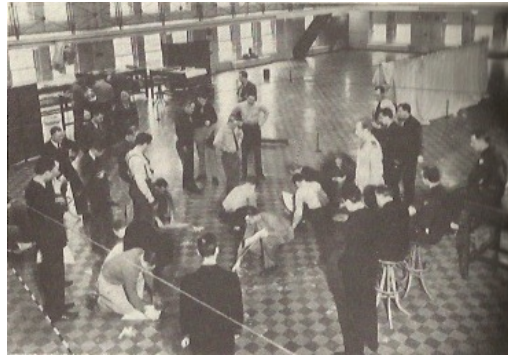
Figure 1. Pringle Hall War Game

progress on Pringle Hall's game floor; though the picture is from approximately 1950, the concepts remained the same.