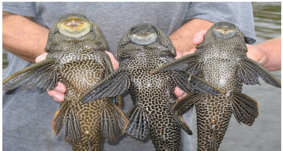
Figure 3. Ventral pigmentation of sailfin catfishes from south Florida. Appearance of fish at left is consistent with that of P. disjunctivus , appearance of fish at center and right with that of P. pardalis or hybrids.