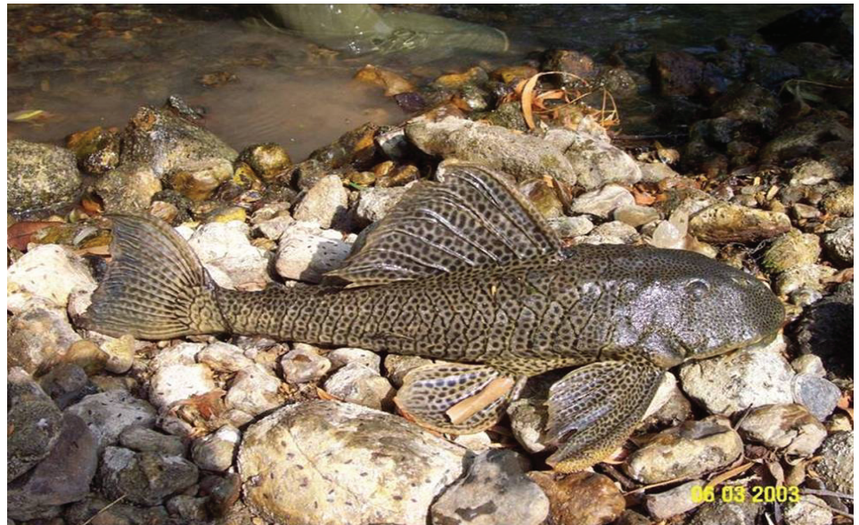
Figure 1. Armadillo del rio ( Hypostomus sp.) from the San Antonio River, Texas. Note dorsal fin with single spine and seven soft rays. Appearance is consistent with that of Hypostomus niceforoi .

In addition to their remarkable boney armor, other adaptations of suckermouth catfishes enable them to survive environmental extremes, food limitations, and predation. A large, vascularized stomach functions as a lung and as a swim bladder allowing fish to breathe