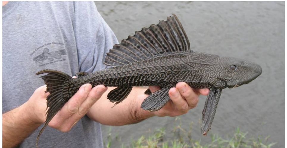
Figure 2. Sailfin catfish ( Pterygoplichthys sp.) from southern Florida. Note dorsal fin with single spine and 12 soft rays.