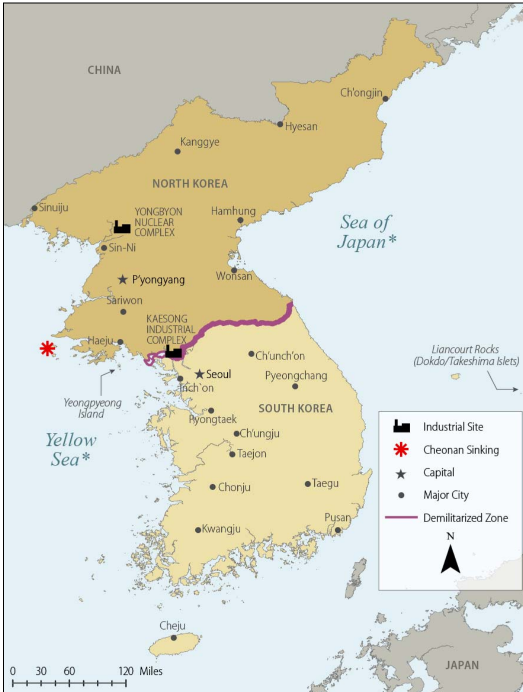
Figure I. Map of the Korean Peninsula