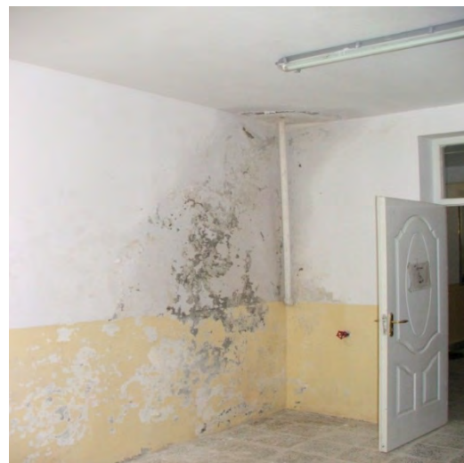
Photo 2 - Leaky Roof Damages Ceilings and Walls