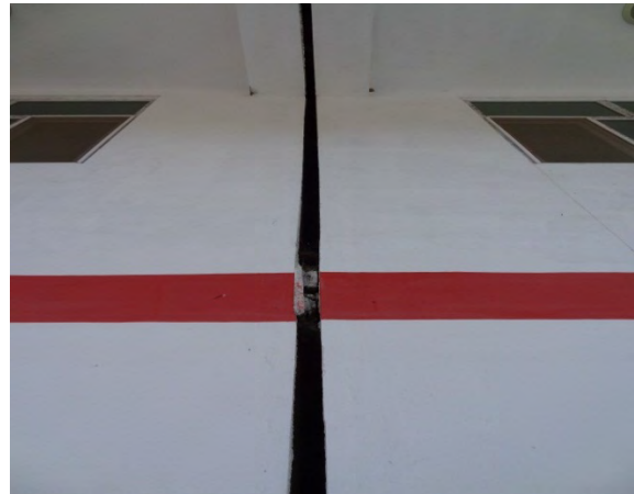
Photo 3 - Excessively Wide Expansion Joint

earthquakes and vertical loads, such as snow, furniture, equipment, and people, consists of a system of reinforced concrete columns and beams combined with reinforced concrete slabs at the floor and roof levels. The unreinforced brick walls rest on the floor and extend to the ceiling between columns. As a result, when ground motion occurs—like during an earthquake—the brick walls are at high risk of collapse.