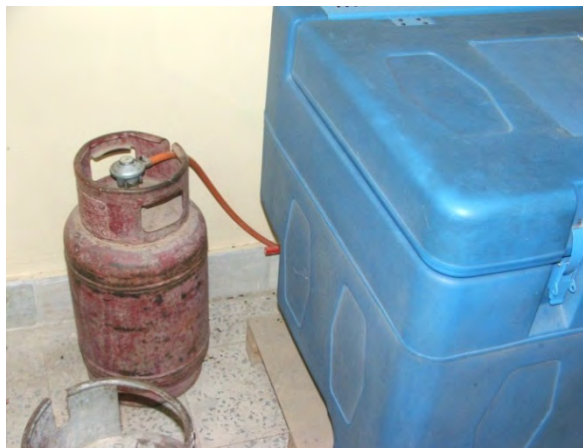
Photo 4 - Propane Supply for Refrigerator

Finally, the hospital staff reported that currently about 25 medical and other staff members are employed at the hospital. This is less than 17 percent of the 150 staff members that the CERP funding documents reported the Salang hospital would employ. The Ministry pays the hospital staff salaries, including those for the doctors, dentist, and midwives.