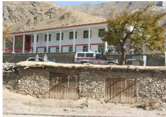
Photo 1 - 20-Bed Salang Hospital

On September 11, 2009, Bagram Regional Contracting Center awarded a firm fixed-price contract (W91B4N-09-C-RP37) to Shafi Hakimi Construction Company, an Afghan company, for $597,929 to provide labor, materials, and equipment to construct and furnish the 20-bed Salang hospital (see photo 1). The CERP-funded contract, with a 365-day period of performance, specified construction of a hospital, including surgical and X-ray areas, a pharmacy, a laboratory, wards for men and women, as well as areas for pediatric, dental and mental health services. The contract also required the installation of electrical, water and septic systems, as well as a separate building with toilet facilities and a guard shack. The hospital was expected to serve the 50,000 inhabitants of Salang district and employ about 150 doctors, nurses, midwives and other staff. In September 2012, the Governor of Parwan province took possession of the hospital, which began accepting patients in January 2013.