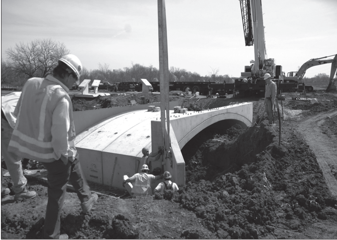
A multisection precast concrete bridge is lowered by crane across a stream.

The Corps, in cooperation with the County Parks Commission, began construction in January 2006. The land was graded around the clock for approximately 2 months to prepare it for spring seeding. Grading sets the stage by achieving a soil elevation that supports the water needs required for wetland plant growth. The soil in the wetland creation areas was then tilled using a 30-inch plow-bedding harrow, to create mounds and depressions, mimicking the uneven surface of a natural wetland. The soil was then fertilized and limed, and this past spring nearly 100,000 trees and shrubs were planted. Habitat