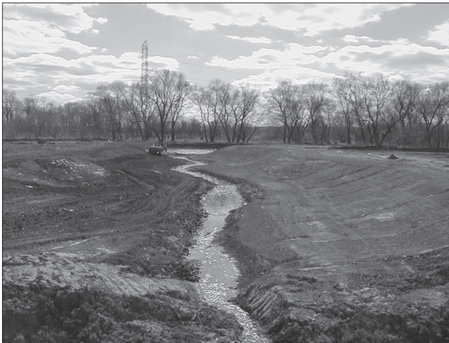
The banks of the "Finderne Brook"—that flows into the Raritan River—have been contoured to prepare for planting.