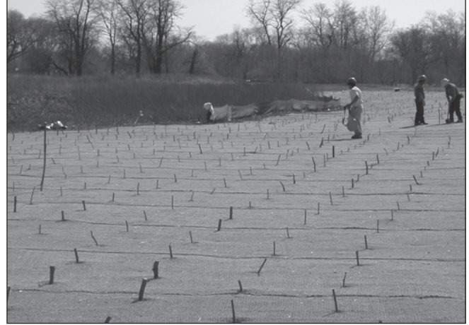
Thousands of "willow stakes" are planted in burlap weed barriers along the side of the stream.

Grassland by the Van Veghten House. Thirty-nine acres of enhanced grassland have transformed the property around the Van Veghten House that overlooks the Raritan River. The grassland provides visitors an unobstructed view of the vista across the floodplain toward the Raritan River. The floodplain was seeded with warm season grasses (Indian grass and bluestem) and wildflowers (ox-eye daisy, asters, and coreopsis) that will support a population of pollinating birds and insects, and the meadow will be a foraging area for the resident fox and red-tailed hawks, as well as other birds and small mammals.