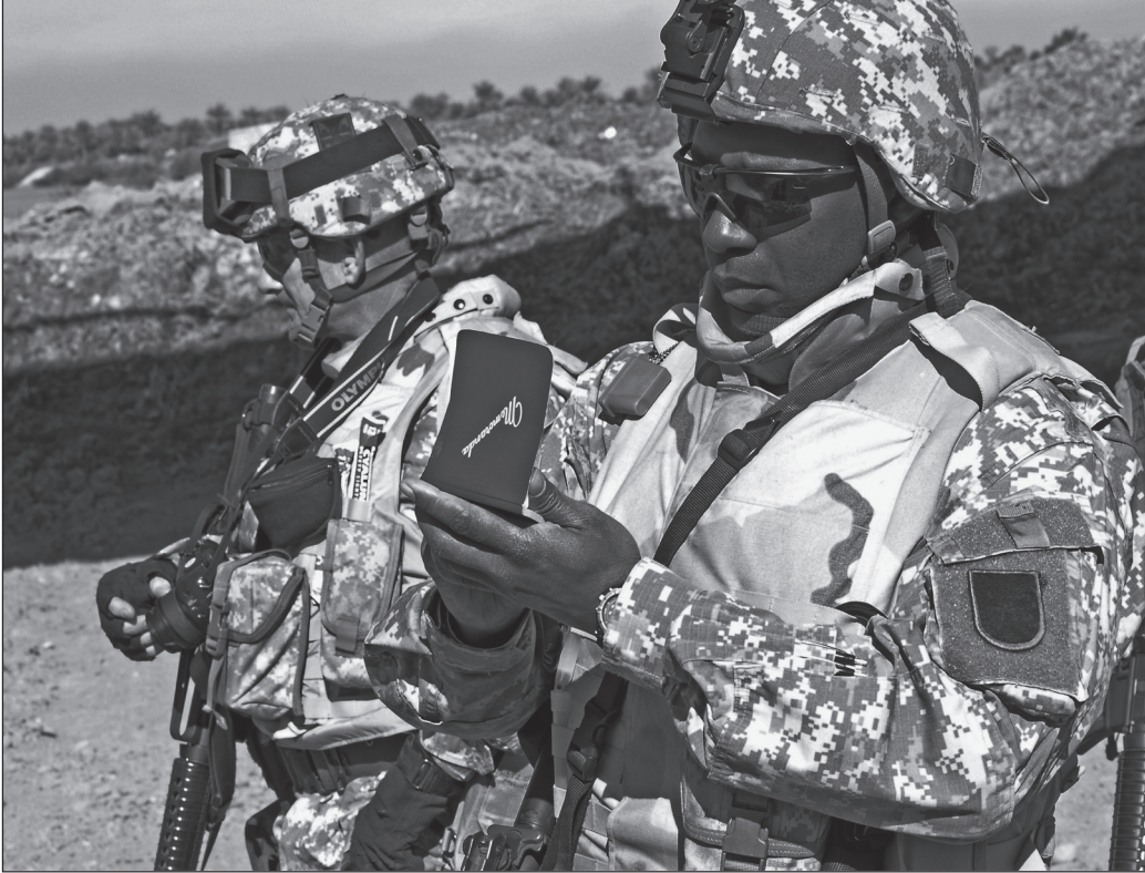
A Soldier records measurements during a bridge reconnaissance on the Tigris River.

Pacific Command. While many of the Reserve Component engineer brigades have a CMS or DMS, the Active Army combat engineer brigades no longer have these assets. When the 130th requested technical engineering support for various Iraq-specific missions, the United States Army Forces Command tasked the 412th to provide a team. The result was Detachment 8.