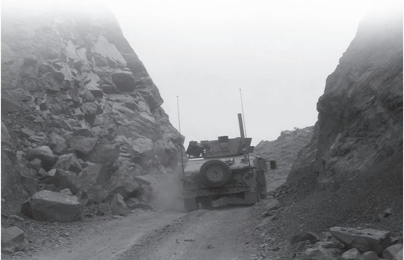
Terrain such as this narrow pass in Afghanistan can limit the mobility of route clearance packages.

T he first EHCC to be deployed to Afghanistan in support of Operation Enduring Freedom was the 766th EHCC, Illinois Army National Guard. Its mission was to provide situational awareness on explosive hazards to coalition