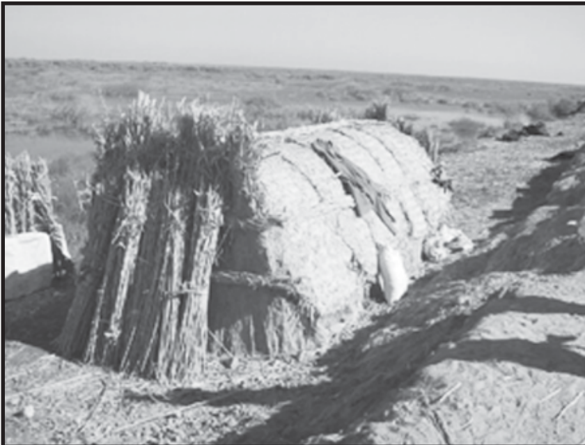
A traditional Marsh Arab hut in southern Iraq, where the Ministry of Water Resources—with help from American agencies—is restoring the Mesopotamian marshes.