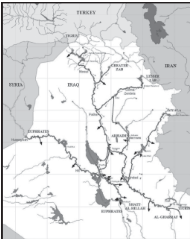
A preliminary HEC-ResSim schematic shows a network of dams and reservoirs throughout the system.

Iraq’s marshlands have complex flow patterns and require specialized models to analyze the flow circulation through the marshes. At the same time, there is a great interest by those devoted to marsh restoration to be able to use the output from the HEC-ResSim water management model to determine critical matters such as whether there is enough water available to restore the marshes to their historic levels. In developing the model, HEC employed a two-phased approach that initially produced a preliminary water balance model that covers the Tigris and Euphrates Rivers, as well as their tributaries in Iraq.