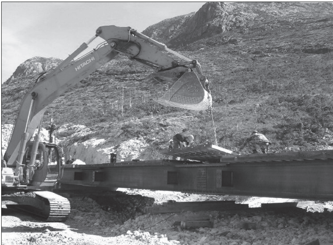
This bridge was constructed to accommodate a scenic stream and waterfall from the mountains above.

Change became the norm: weather conditions changed by the hour, personnel availability fluctuated from day to day, and there were equipment shortages and a lack of supplies,