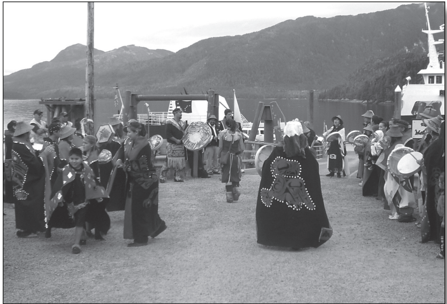
The Metlakatla Indian community celebrates completion of the road.

W hile building the road was an extraordinary humanitarian mission, an equally impressive achievement is the safety record— not one case of a lost limb or loss of life during the 10-year project . An initial accident probability analysis performed by the United States Army Maneuver Support Center (MANSCEN) Safety Office, Fort Leonard Wood, Missouri, in 1999 identified that statistically, 17 fatalities could be expected over the programmed 10-year project. Commanders developed an aggressive risk analysis of