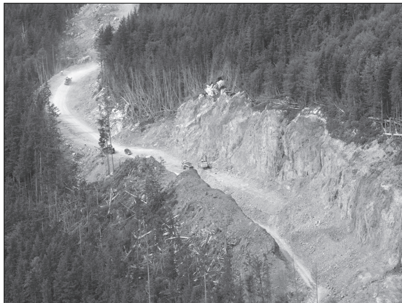
During Operation Alaskan Road, nearly the entire length of the road had to be cut out of the side of the mountains.

On 15 September 2007, the Missouri Army National Guard lowered its flag; the military mission was complete. Approximately 12,000 military Service members constructed a lifeline to the mainland for the people of the Metlakatla Indian Community. Training in a real-world setting provided the participants an opportunity to experience conditions impossible to replicate in a training facility.