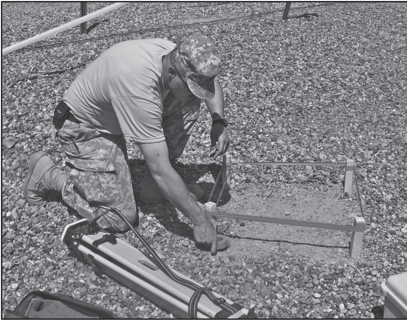
A Soldier stakes off a base station setup, which is a temporary benchmark for the survey.

It is better to have the data and not need it than to need it and not have it. However, time constraints can make it difficult to get these extra details, particularly if the survey crew has to take considerable time on-site working out the details of the survey. A site visit before the survey with all key project members—to include the client, the designers, and the construction supervisors—is essential for mission success. It ensures that the survey leaders can better plan the site work by seeing it, the client’s needs are worked out on the ground and understood by all, and data needs are thoroughly understood.