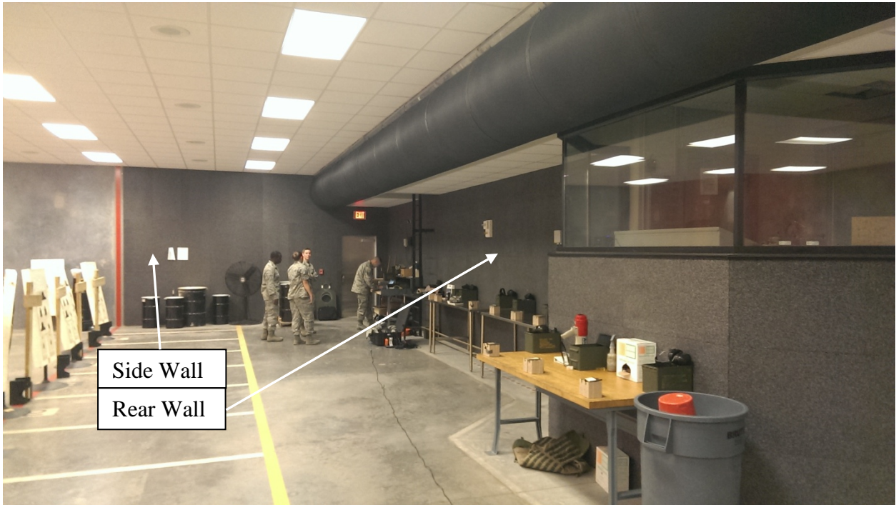
Figure 2. Patrick AFB CATM Sound-Absorbing Material

c. Engineering controls were added to the CATM firing range facility in 2012 in accordance with Engineering Technical Letter, 11-18: Small Arms Range Design and Construction, para 7.2.9 through 7.2.9.4. These controls include sound-absorbing material added to the side walls from the red firing line back to the rear wall, and the back wall, as shown in Figure 2.