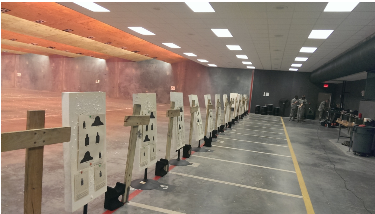
Figure 1. Patrick AFB CATM Range Lanes 1-14

a. The Patrick AFB CATM range is a fully enclosed, 100-meter-long firing range with 14 total firing lanes (see Figure 1). The range is used to train personnel on M4, M9, M11, M870, M240, and M249 weapons firing. A noise-reverberant field occurs during firing where the noise energy is reflected off the ceiling, walls, and floor surfaces, thereby increasing noise levels for a longer duration. Down range of the firing line is a series of steel safety baffles covered with plywood on the ceiling that are designed to deflect stray bullets and prevent bullets from leaving the range. These panels are closely spaced, thereby reflecting acoustical energy and increasing the duration of noise levels.