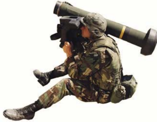
Figure 2. The Javelin Gunner Looks Through the Command Launch Unit (Lyons, Long, & Chait, 2006)

Javelin required several immature technologies in order to successfully attain program requirements. A number of the subsystems were based on these immature technologies. For example, the munition required a tandem shaped charge to first set off an explosion to deflect reactive armor defensive systems and then a primary munition for armor penetration and target defeat. The target locating and missile guidance subsystems were particularly troublesome technical issues. Three very different technologies were initially considered in a technology development phase, in order to not constrain the materiel solution to the FLIR approach: a laser-beam riding system, a fiber-optic guided system, and the forward looking infrared system. Each of the three potential technologies generally offered the needed capabilities and represented acquisition options. Rather than choosing a single technology, in August 1986, the Army decided to award three Proof of Principle (technology demonstration phase) contracts of $30 million each to three competing contractor teams to develop the technologies and conduct a “fly-off” missile competition. The Army paid $90 million for these three options that all had potential but none with a guarantee of success. By doing this, the Army acquired the right, but not the obligation, to purchase the most successful technology for the Javelin missile. This comprises the essence of a “real option.”