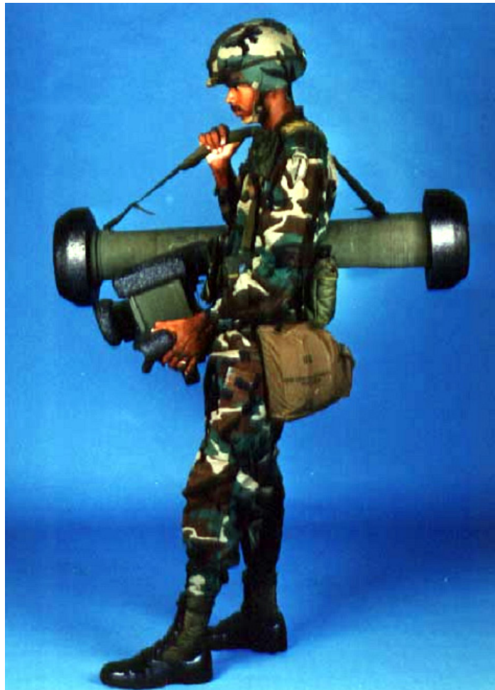
Figure 1. The Javelin Anti-tank Weapon System Missile and Command Launch Unit (Personal communication with US Army Infantry School, Jan, 1992)

The Javelin is a “fire-and-forget” missile. This fire-and-forget capability came from the Joint Army/Marine Corps Source Selection Board’s decision to select the development team’s AAWS–M design, which coupled an imaging infra-red, forward-looking infra-red radar IR (FLIR) system with a beyond state-of-the-art onboard software tracking system.