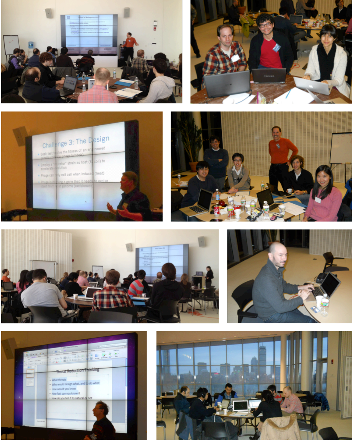
Figure 2. Bioinformatics Challenge Day 2, February 2, 2013, MIT Media Lab, Cambridge, MA.