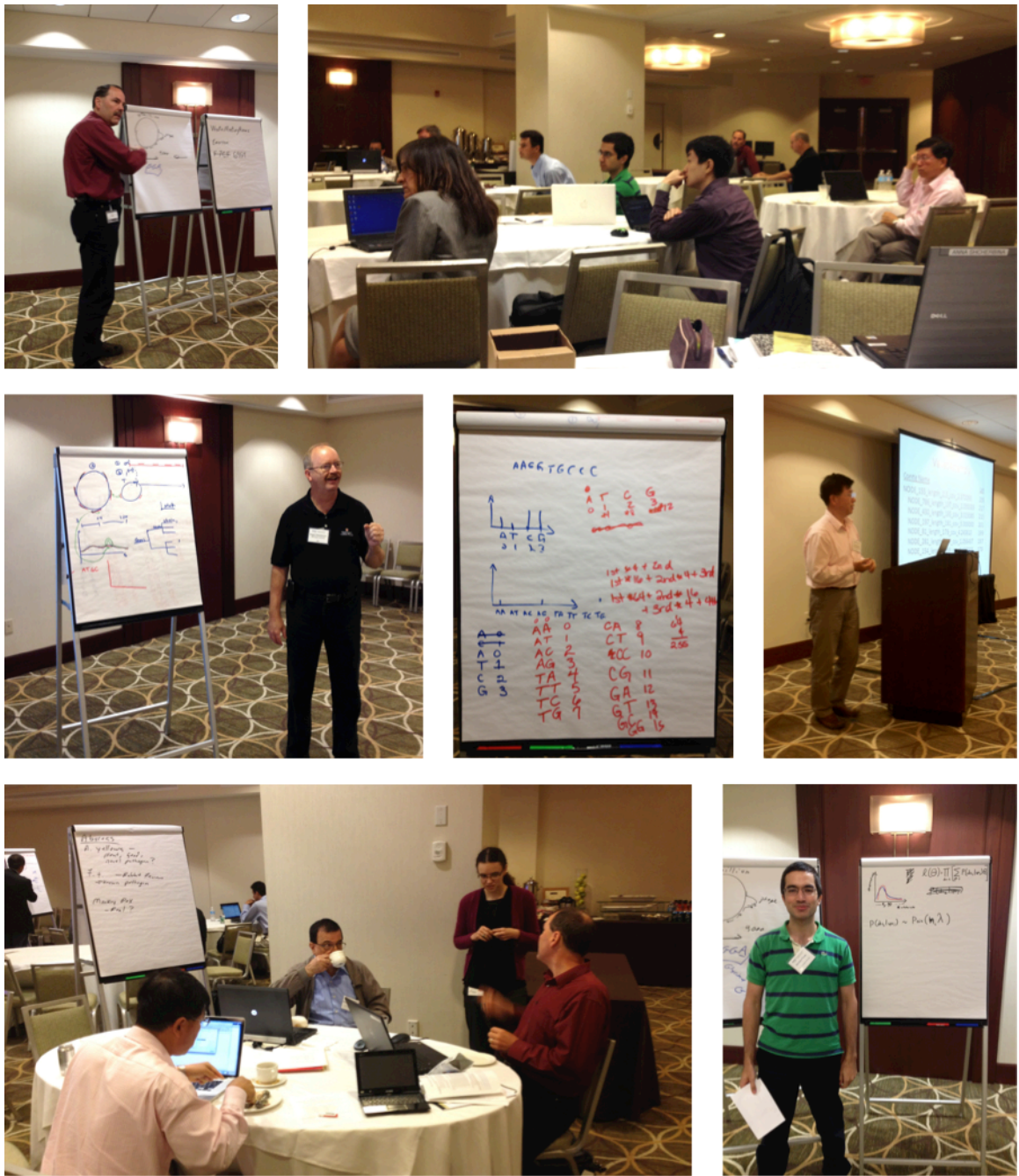
Figure 1. Bioinformatics Challenge Day 1, 10 September 2012, IEEE Big Data Conference, Waltham, MA.