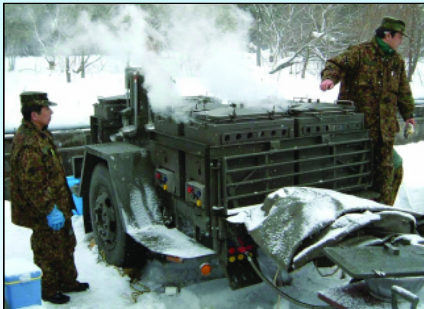
Northern Army soldiers prepare rice for a meal during a field training exercise at the Kami Furano Training Area in Hokkaido.

The logistics support unit's transportation unit, formerly a table of organization and equipment unit, is now a table of distribution and allowances unit. The number of trucks in a regional army transportation unit is based on the number of units supported. The transportation