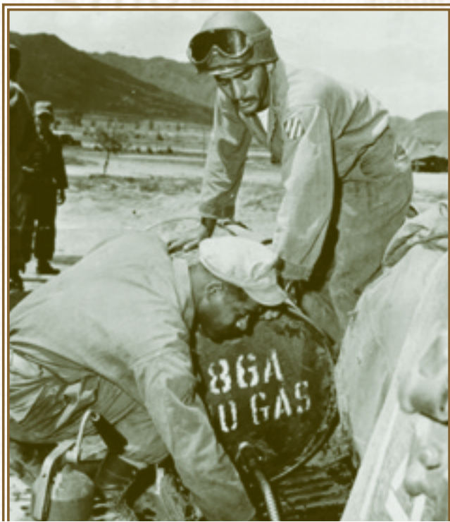
Soldiers of the 3d Infantry Division refuel a tank with a 55-gallon drum in 1952.

September to November 1950: The UN counter-offensive. Rather than attempting to regain the offensive from Pusan, the UN commander, U.S. General Douglas MacArthur, decided to land forces at Inchon, on the west coast of the peninsula just west of Seoul. (MacArthur was the commander in chief of the U.S. Far East Command [FEC] and had become commander in chief of the United Nations Command on 10 July 1950.) Through this daring attack on 15 September, MacArthur was able to surprise and outflank the bulk of the North Korean forces. The Inchon landing, combined with a breakout of U.S. forces from the Pusan perimeter, resulted in the destruction of the North Korean Army and allowed UN forces to