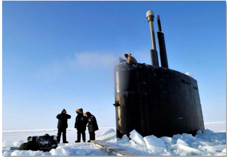
Members of the Applied Physics Laboratory Ice Station participate in Ice Exercise (ICEX) to assist operations and training in the challenging and unique environment that characterizes the Arctic region.

The Department's two supporting objectives describe what is to be accomplished to achieve its desired end-state. These objectives are bounded by policy guidance, the changing nature of the strategic and physical environment, and the capabilities and limitations of the available instruments of national power (diplomatic, informational, military, and economic). Actions taken to achieve these objectives will be informed by the Department's global priorities and fiscal constraints. In order to achieve its strategic end-state, the Department's supporting objectives are: