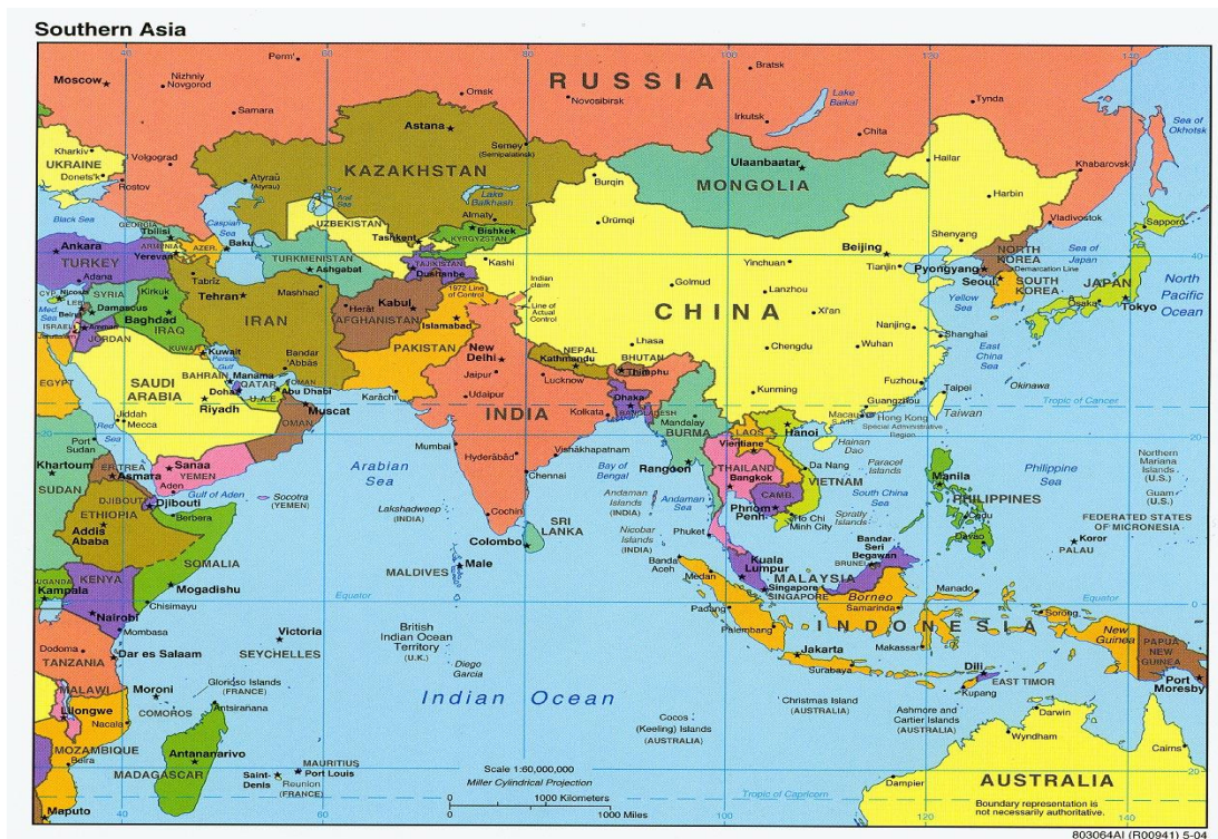
Map1- Southern Asia

Despite being geographically isolated by the Himalayan mountain range from South Asia, China's role in South Asia is very significant. 14 China shares a common border with four South Asian nations (India, Pakistan, Nepal and Bhutan), while the other three (Bangladesh, Sri Lanka and Maldives) do not share borders with China (Map 1). Nepal and Bhutan are situated along the Himalayan range and act as the buffer states between China and India. Though China had a long history of border tensions with India, the cross-border investment and trade continue to take precedence over past security conflicts. China is taking bolder steps to strengthen its position vis-à-vis the United States across Asia in general and South Asia in particular. 15 Chinese involvement in South Asia is mostly focused on the two largest countries of the subcontinent, India and Pakistan.