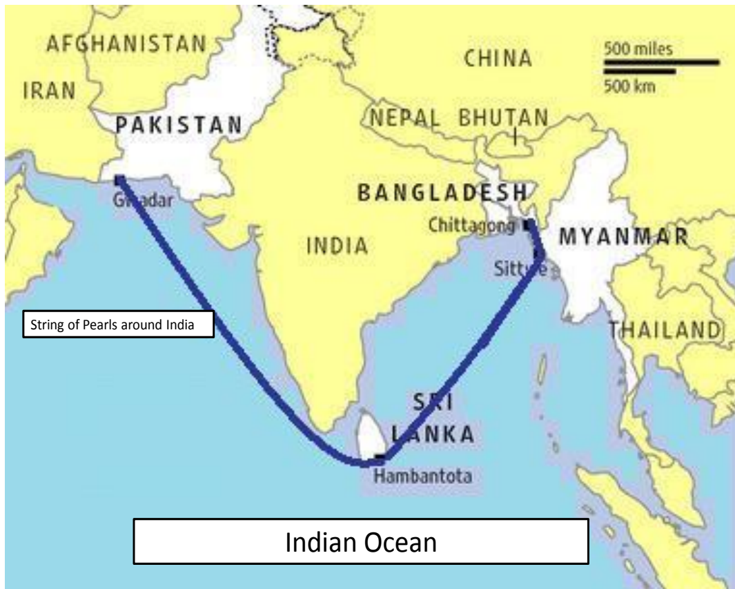
Map 2- Indian Ocean

pipeline and railway line from Kyauk Phyu (Sittwe) to southwestern China's Yunnan province (Map 2).