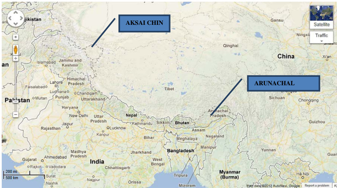
Figure 1. Major Disputed Areas of Aksai Chin and Arunachal Pradesh along Sino-Indian Border

Himalayan Ranges. The entire boundary between India and China has not been formally delineated, however in terms of potential conflict, the Eastern and Western Sectors figure most prominently.