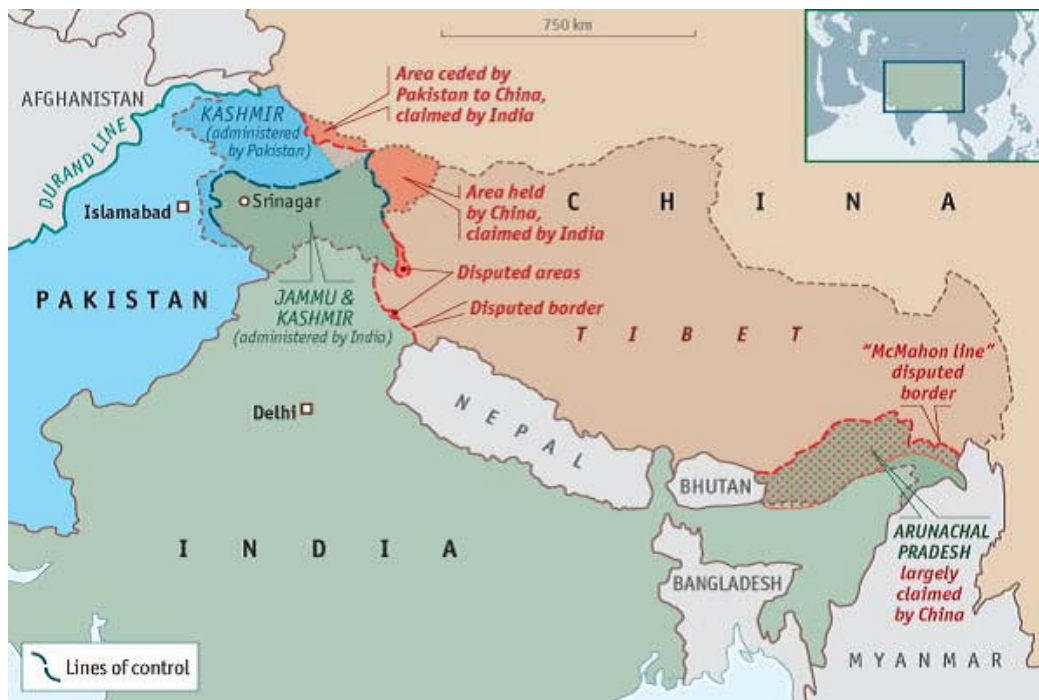
Figure 2. All Disputed Areas along Sino-Indian Border

The bone of contention is the legitimacy of possession of land areas of the Aksai Chin and Arunachal Pradesh. India disputes the Chinese possession of Aksai Chin region; and conversely, China disputes the Indian possession of Arunachal Pradesh. China launched an offensive in October and November 1962 to regain this territory.