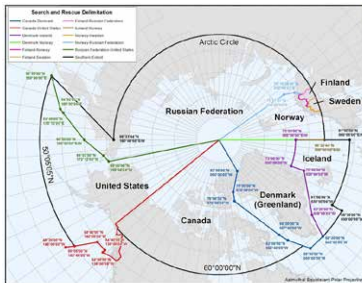
Figure 2. Arctic SAR agreement, areas of application. (Based on geographic coordinates in the annex to the Agreement on Cooperation on Aeronautical and Maritime Search and Rescue in the Arctic , 12 May 2011, http://www.ifrc.org/docs/idrl/N813EN.pdf . Map from “Arctic Search and Rescue Agreement,” Arctic Portal, accessed 3 September 2013, http://arcticportal.org/features/751-arctic-search-and-rescue-agreement .)

the Arctic States, with the involvement of the Arctic Indigenous communities and other Arctic inhabitants on common Arctic issues.” 19 The council is unique in that it addresses only nonsecurity issues faced by the Arctic states; the region’s indigenous peoples and observers characterize it as “populated more by scientists and scholars than by statesmen.” 20 Mindful of its previous call in 2008 to “further strengthen search and rescue capabilities and capacity around the Arctic Ocean,” the council signed a SAR treaty at Nuuk, Greenland, in 2011—the Agreement on Cooperation on Aeronautical and Maritime Search and Rescue in the Arctic (the Nuuk Agreement ), which states that each party will establish and maintain an “adequate and effective search and rescue capability” within its designated area (fig. 2). 21 Further, it binds member nations to coordinate SAR efforts in case of a plane crash, cruise ship sinking, oil spill, or other disaster across the High North. 22