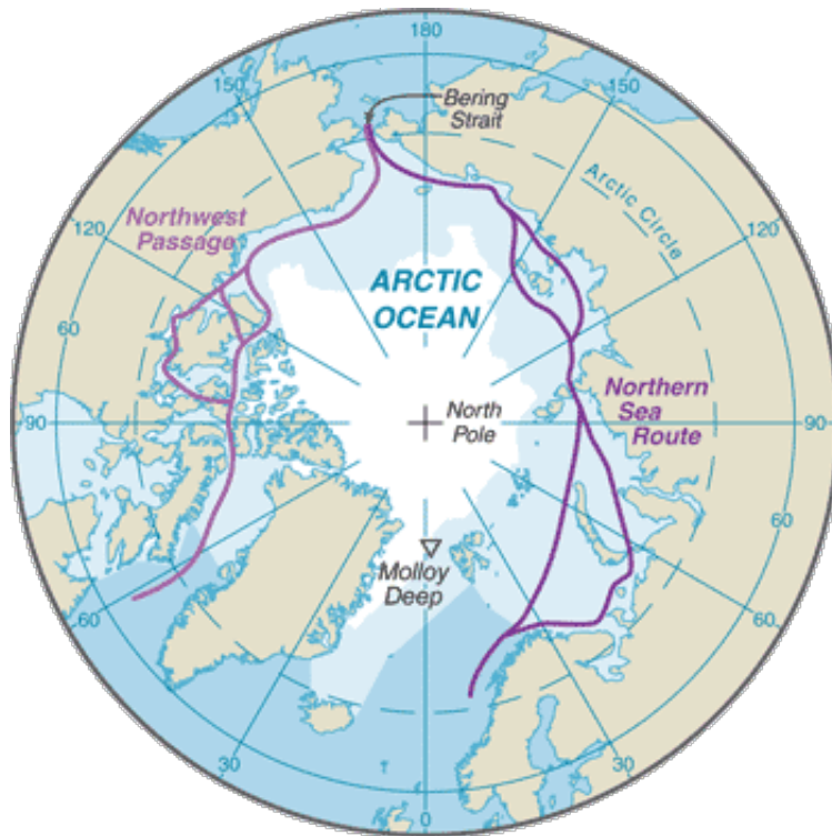
Figure 1. The Northwest Passage(s) and the Northern Sea Route. (Reprinted from "Arctic Ocean," in Central Intelligence Agency, The World Factbook , accessed 3 September 2013, https://www.cia.gov/library/publications/the-world-factbook/geos/xq.html .)

The Northwest Passage actually includes more than one route across the Canadian Archipelago, an expanse of territory consisting of 73 major islands and 18,114 smaller ones encompassing an area roughly the size of Greenland. The more southerly passage has a draft of only 13 meters while the one to the north has an average depth of 200 meters. The more southerly channel, the Union Strait, holds the promise of less ice but may be unavailable to deep-draft vessels. To the north, the recently opened (2007) McClure Strait is deeper but more ice laden. 8 A Norwegian study of 2011 lists no fewer than seven different routes through the Northwest Passage, explaining that the current navigation channel offers the best sea-ice conditions at the time. 9