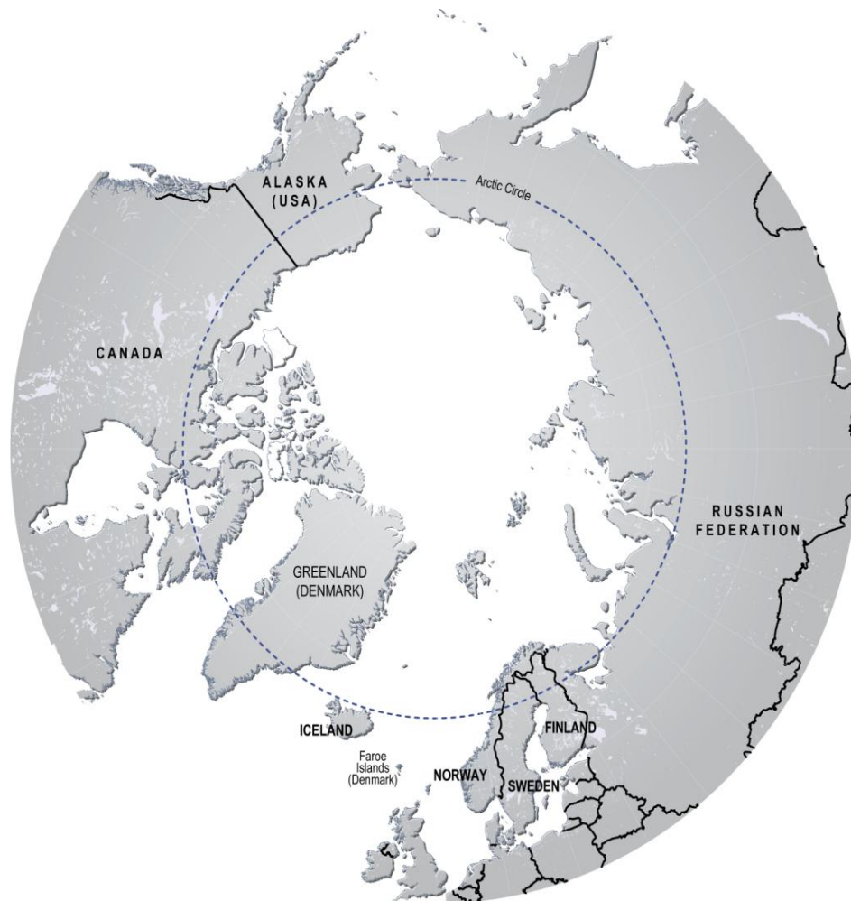
Figure 1. Arctic Map 4

There are multiple definitions of the Arctic that result in different descriptions of the land and sea areas encompassed by the term. This paper relies on one of the most common and basic definition that defines the region as the land and sea area North of the Arctic Circle (66, 24 degrees North). 5 In Norwegian government documents, the term “the High North” is often used to describe the Arctic. Eight nations have territory