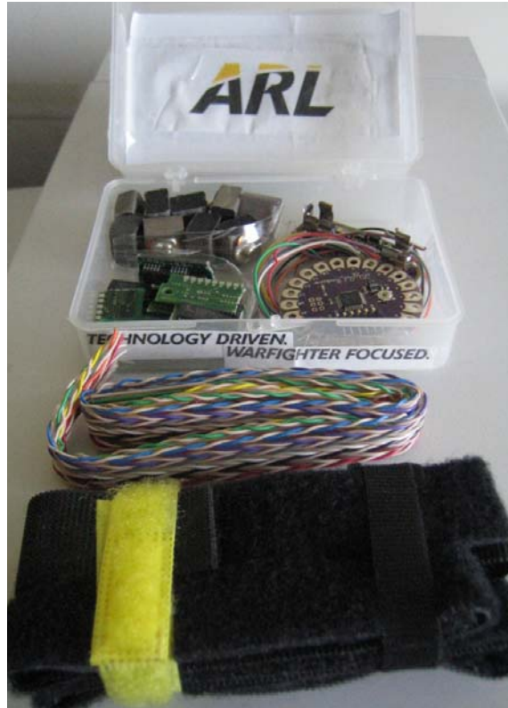
Figure 2. Sample kit. Counterclockwise from the upper left are sensors, channel electronics, main board, and attachment system. The pictured components are intended to illustrate the concept. They are not functional.