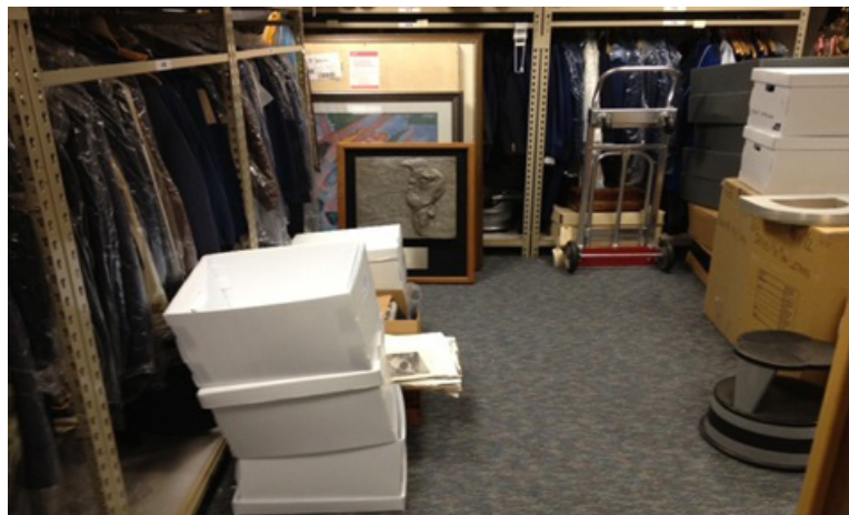
Figure 1. Heritage Assets Not Recorded

The former museum specialist stated that there were heritage assets scattered across the USAFA campus that were not recorded.