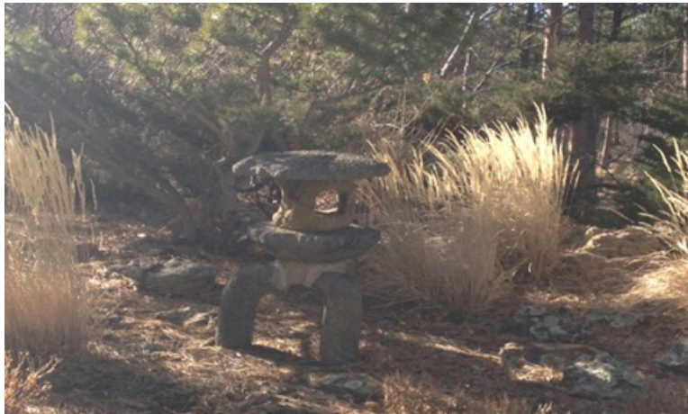
Figure 3. Japanese Lantern Not Properly Conserved

See Appendix D for a table summarizing the 17 heritage assets that were not properly conserved.