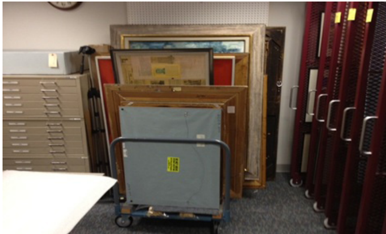
Figure 2. Paintings Not Properly Conserved

There were many other heritage assets such as airplane models, maps, officer's uniforms, and trophies in the Harmon Hall basement storage room that USAFA did not adequately protect and conserve. In addition, we observed another sample item, a Japanese lantern, located on the patio of the USAFA Superintendent's residence without protection from