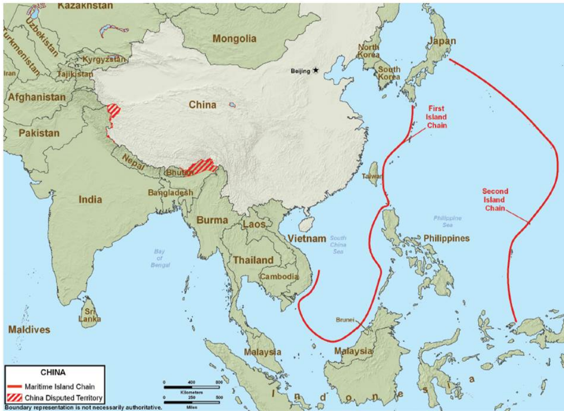
Figure 1: China's Strategic Island Chains 83

Liu's strategic foresight was not the only factor that led to the adoption of this ambitious maritime strategy for the PLAN. The strategic environment in the mid-1980s that supported this maritime strategy also played an important role. 84 External factors included fundamental changes in China's external security environment—like the diminished strategic threat posed by the Soviet Union, the rising capabilities of regional navies and increasing national interest in maritime resources. Internal factors included the “loosening of doctrinaire views in the post-Mao era, Deng Xiaoping's investment of political capital in modernizing the Chinese military,” and China's rapidly growing economic wealth. 85