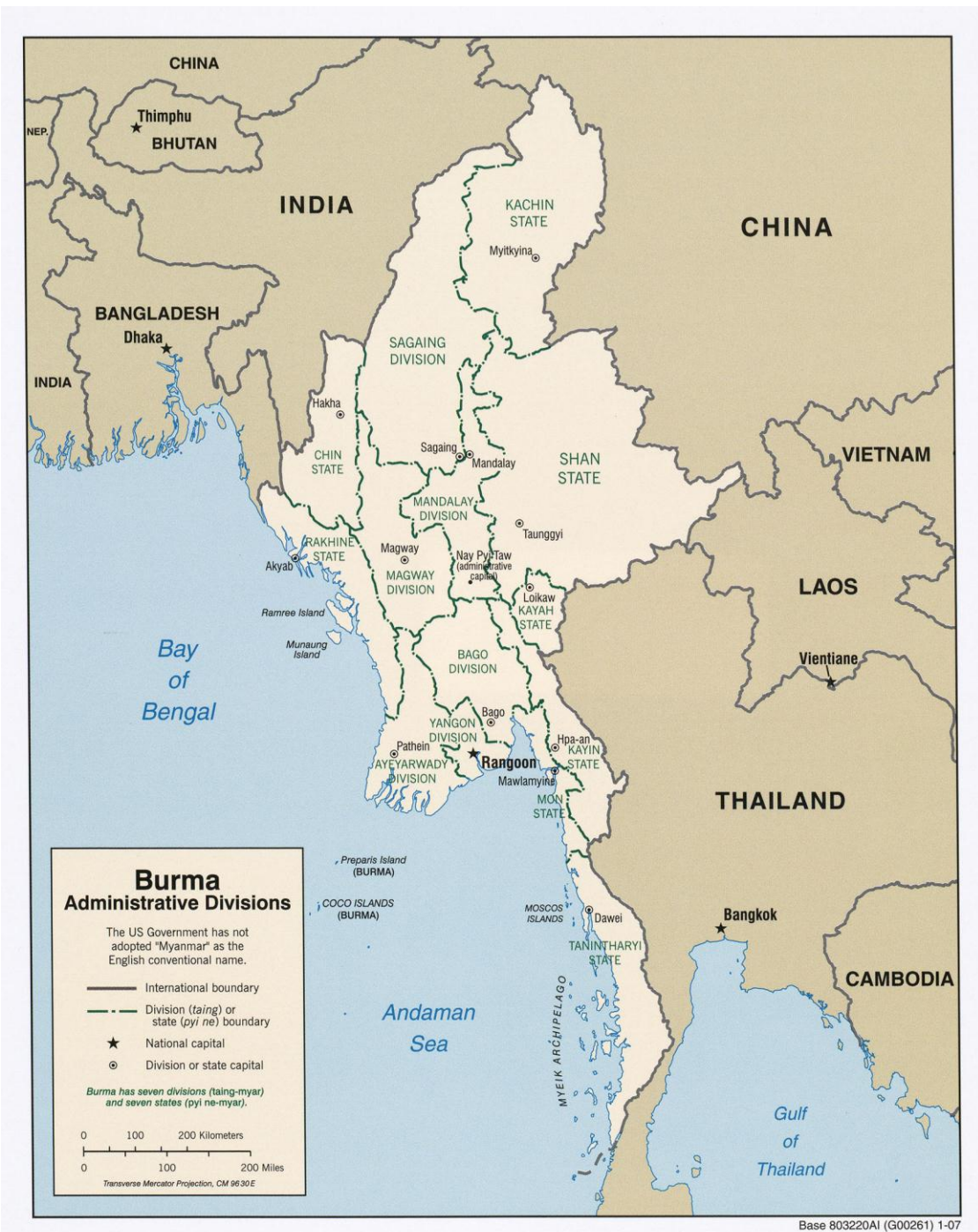
Figure 4. Burma's Administrative Divisions 217