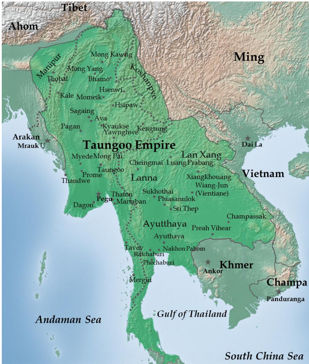
Figure 3. The Extents of the Toungoo Empire in 1580

The Pagan, Konbaung, and Toungoo dynasties similarly organized their kingdoms into territorial categories that defined each area’s relationship to the state. There were slight variances between the dynasties, but each dynasty similarly had a power and influence that was administratively invasive locally, but decreased in influence with increased distance from the capitol. The basis for power was built upon the local Burman population, and from that base expanded outward to different degrees upon the