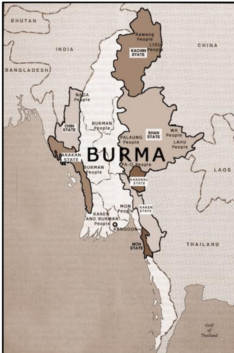
Figure 2. Burma's Ethnic States and Ethnic Population Concentrations 11

The atrocities and horrors of Burma's ethnic conflict are the very kind that has compelled scholars and politicians to conceptualize and implement government processes