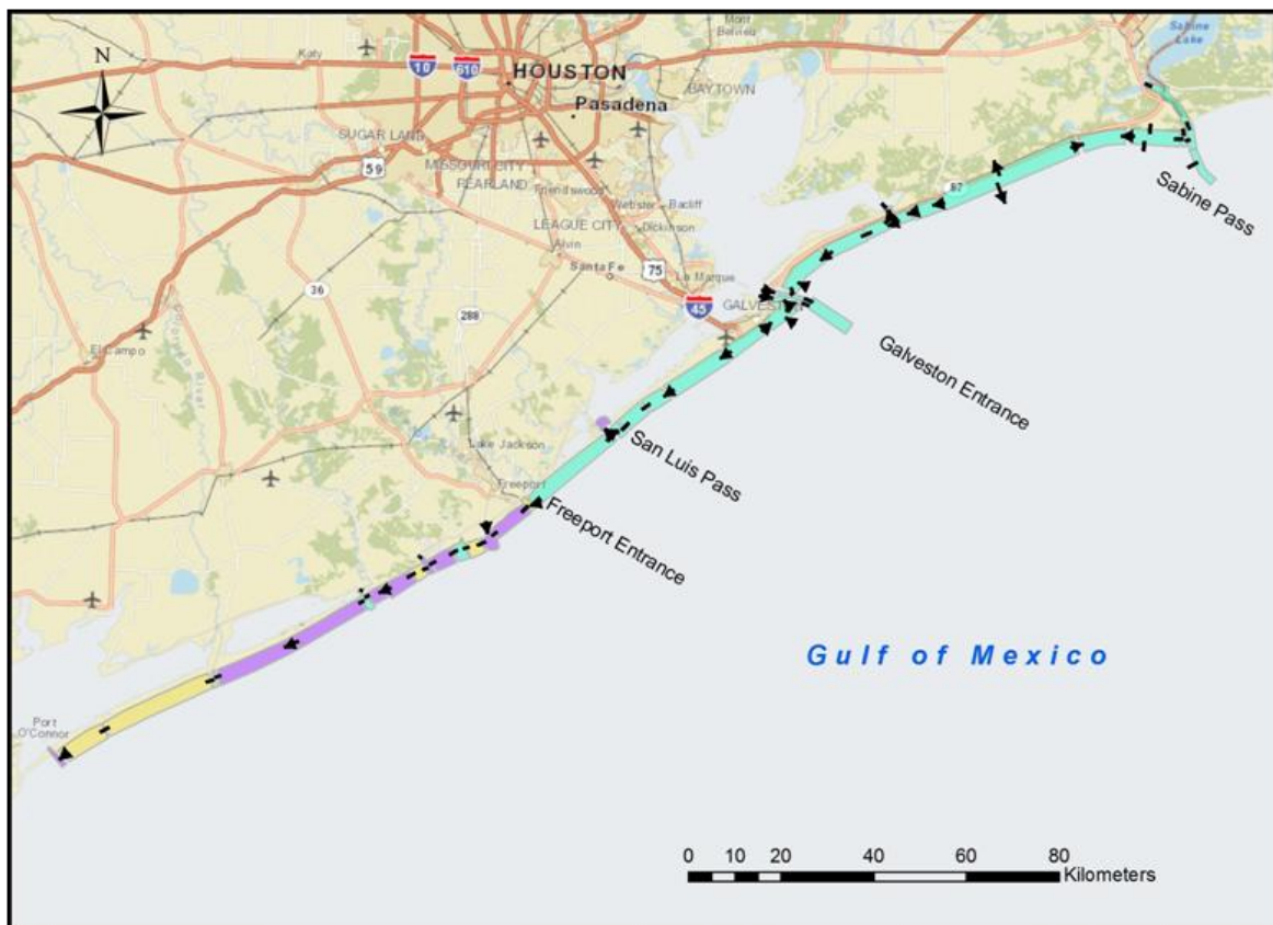
Figure 1. Upper Texas Coast regional sediment budget cells from Sabine Pass to the Matagorda Ship Channel, TX.

This work used the SBAS Sediment Budget Tool, previous applications of the Genesis model (a shoreline change model designed for project scale engineering studies) (Hanson 1989, Hanson and Kraus 1989, Gravens et al. 1991), and Texas Shoreline Change Project data (Gibeaut et al. 2000). The final product from this task is a sediment budget with cells and lines representing littoral cells and transport fluxes derived from the regional sediment budget analysis. The data were output into shapefiles and were made available on the SWG website. The data were also populated into the SWG eGIS, which is also referred to as the Navigation and Coastal Databank (NCDB), currently under development.