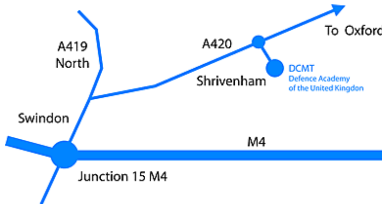
Figure 2 Shrivenham Campus in relation to the M4 Motorway

Cranfield University's site at Shrivenham, part of the Defence Academy of the United Kingdom, formerly known as the Defence College of Management and Technology, lies close to the M4 motorway which links London and South Wales. It is eight miles (12 km) from Swindon, the nearest town, which lies off the M4. The University campus is well positioned for communication with other major towns and cities, with Bath, Cheltenham, Bristol and Oxford all within an hour's drive and London less than two hours away.