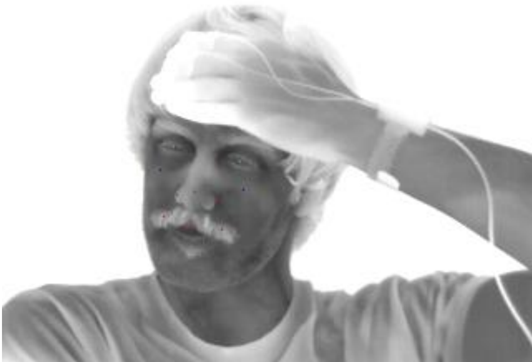
Figure 1. Sample frames from IR video stream, with tracking marks superimposed