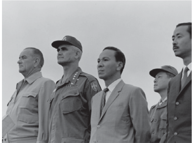
President Lyndon B. Johnson, GEN William Westmoreland, and president of South Vietnam Nguyen Van Thieu, October 1966.

General Creighton Abrams, when told that company grade officers are idealistic, replied, “Yes and it’s our job to keep them that way.” Advice given to young officers who seek a successful career path are typically told to stay with troops. The five assignments resemble a progression up a steep ridgeline—platoon leader, company commander, S3/XO, battalion commander, brigade commander. Yet, these five assignments constitute perhaps only 10 years out of a 26-year career.