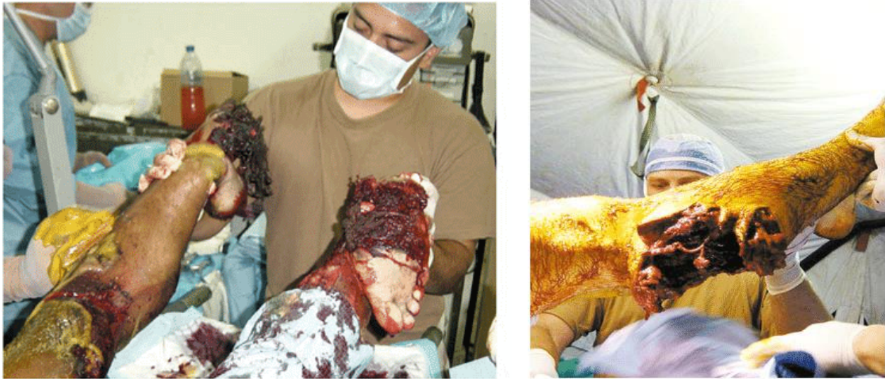
Figure 2: Left, a common type of injury associated with roadside improvised explosive device run over by a Humvee. Right, typical large-fragment wound of the leg. [34].

As of January 22, 2010 the total number of Warfighters wounded in action (WIA) that have not returned to duty in Operation Iraqi Freedom (OIF) and Operation Enduring Freedom (OEF) are 13,910 (~44% of WIA) and 2,811 (~58% of WIA) respectively [33]. Most injuries resulting from gunshot wounds, blunt trauma, and explosives accounting for the majority, are to the extremities and involve the musculoskeletal system [7, 31, 32, 35, 37, 38, 40, 41, 44-47]. The severity and complexity of war injuries are significantly different than most civilian trauma, and in particular war injuries are often dirty (e.g. contamination with fragments dispersed in tissue and multiply resistant environmental bacteria) [42].