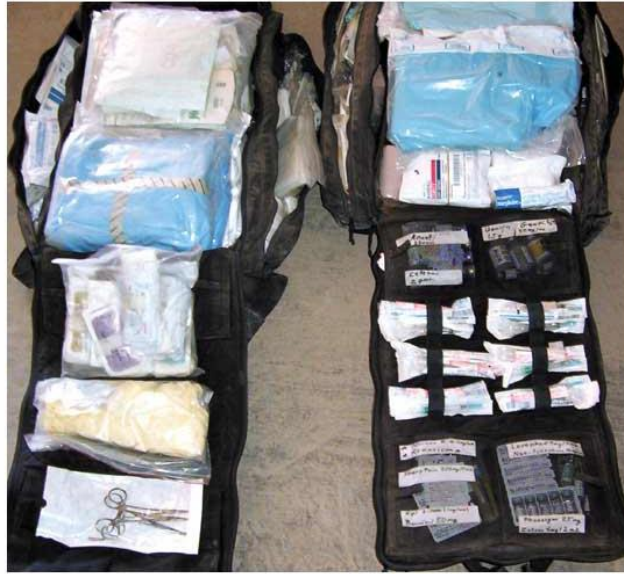
Figure 5: General surgery backpack and anaesthesia backpack, two of the five packs containing the rapid-response surgical system [34]. Products must fit within this bag for Level II and be stored without controlled environment.