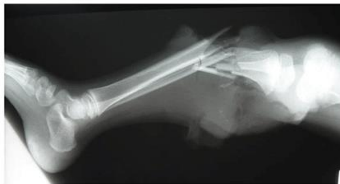
Figure 3: Radiograph of mangled leg from blast injury [34].