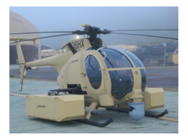
Boeing Unmanned Little Bird UAV at the Marine Corps MountainWarfare Training Center.

autonomous and teleoperated takeoffs, flight, delivery of sling loaded cargo, and landing. At the time of this writing the final report wasn't available, but the Marines seemed pleased with the overall results. The third and last flight demonstration will take place in March 2010, again at Dugway, employing the Boeing A-160 Hummingbird UAS.