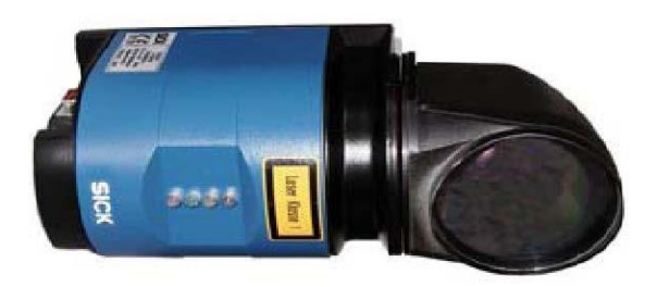
Dragonfly Pictures 100m SICK LD-LRS LIDAR and Servo.

Both companies Dragonfly Pictures and Piasecki Aircraft are using similar technical approaches, and are integrating commercial-off-the-shelf laser imaging detection and ranging systems (LIDAR), with their respective Unmanned Air Vehicle (UAV) flight control and mission management systems. The LIDARs, mounted under the chin of the each vehicle, scans in both the horizontal and vertical planes, looking for flight path and landing zone obstacles. Coupling this LIDAR/autopilot system with digital terrain maps allows the UAS to takeoff, navigate, transit, select a landing site, and land – all autonomously. Both companies will demonstrate this capability during their upcoming flight demonstrations later this year.