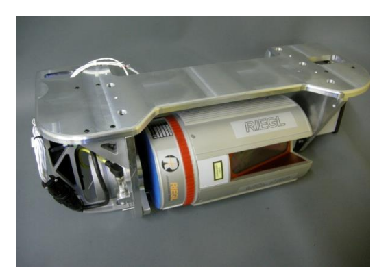
Piasecki Aircraft RIEGL VQ-180 LIDAR.