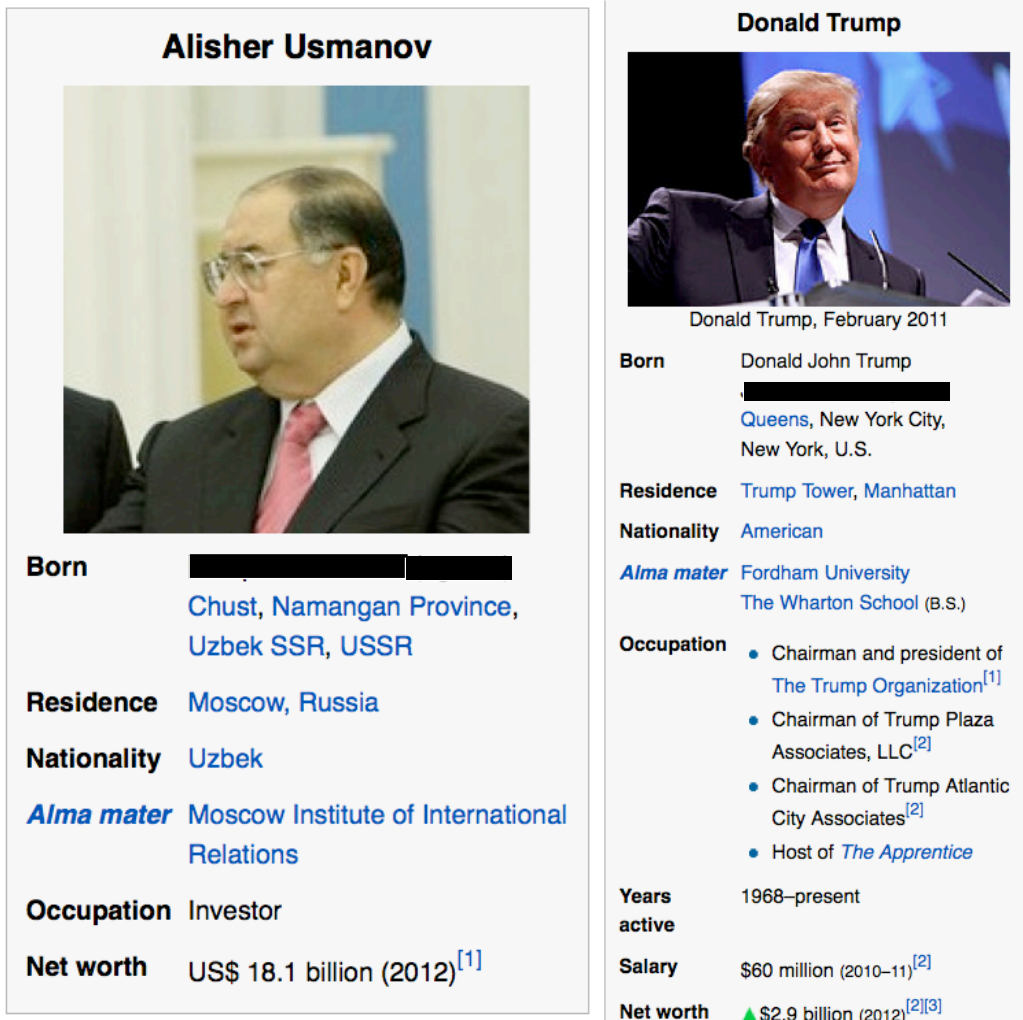
Figure 2: Example Information Boxes from Wikipedia