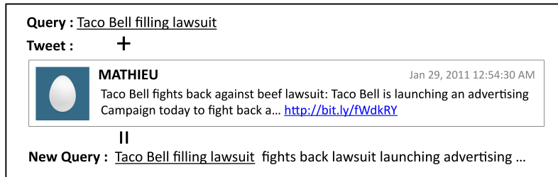
Fig. 2. New query = original query + relevant tweet by user feedback.

detect a relevant tweet without much effort. Finally, we combine the selected tweet with the original query to create a new query for retrieving a new set of tweets. Figure 2 presents an example of the original query ( Taco Bell filling lawsuit ), its relevant tweet, and a new query.